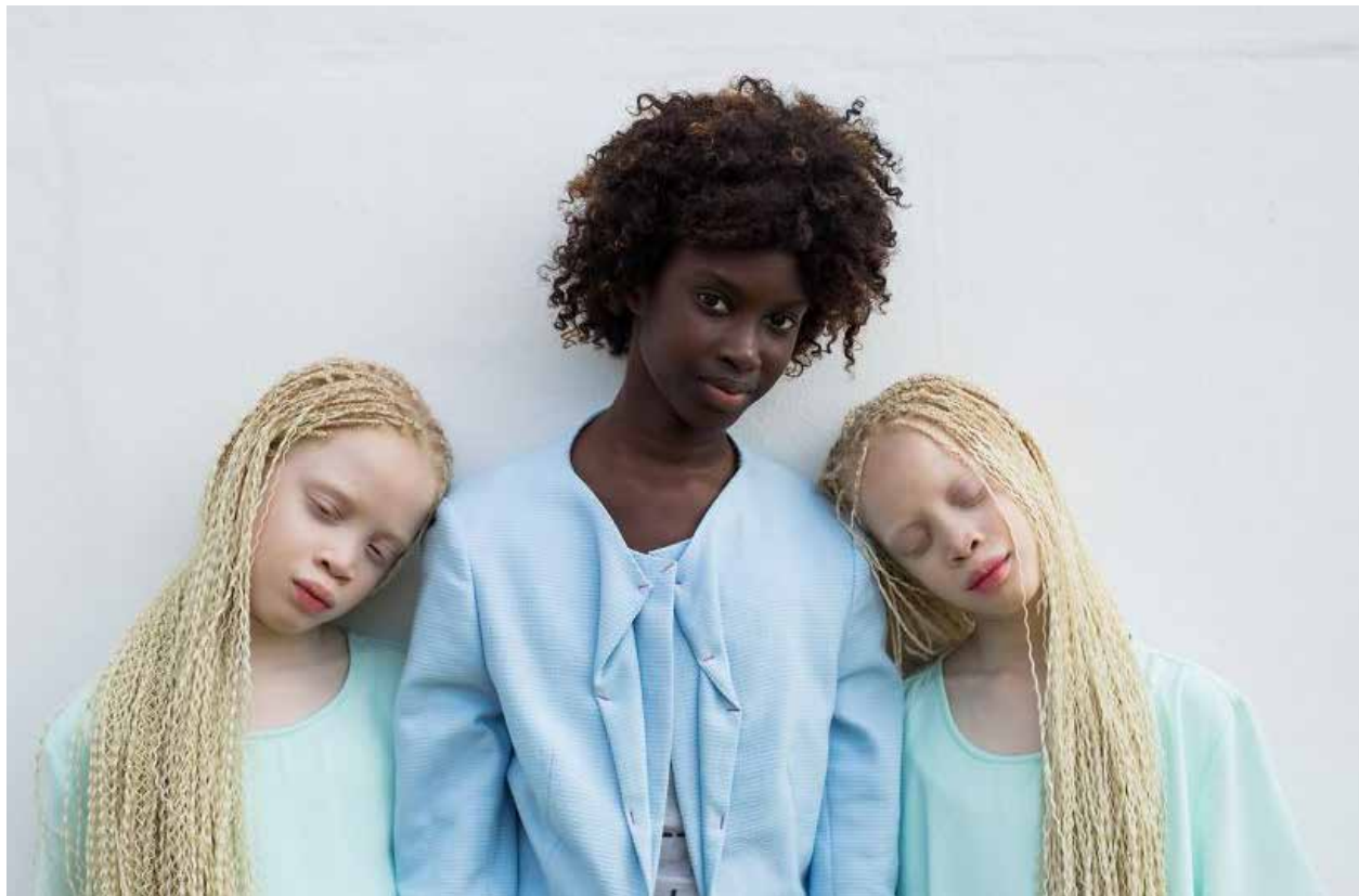
"Twins with their big sister, Brazil"

However, in many other countries, social assistance schemes are generally weak. In Nigeria, there is no inclusive financial benefit for people with albinism. 402 Even in countries where social security programmes do exist, people with albinism lack knowledge about how to access these benefits. 403 In Brazil, the social assistance program for people with disabilities who are unemployed, Benefício de Prestação Continuada (BPC), is relied on by many people with albinism. However, accessing the BPC program is difficult because people with albinism do not always meet the disability test. As a result, people with albinism often have to initiate a court process to receive the benefits. 404 In line with their responsibility to ensure the right to work and an adequate standard of living, governments have an obligation to ensure that social security programmes are robust and accessible to people with albinism.