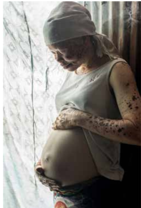
“Pregnant woman, DRC”

Women and children with albinism are more susceptible to violence and ritual crimes. 525 As discussed in Chapter 2 (Right to Life), harmful practices related to accusations of witchcraft and ritual attacks most often affect women and children. Women experience the highest rates of witchcraft accusations, and accusations against children are on the rise. As a result, they are more frequently attacked, abandoned, or banished. 526 Additionally, women and girls with albinism are more often subject to ritual rape 527 based on erroneous beliefs that sexual intercourse with a person with albinism brings luck and cures diseases, including HIV. In addition to the trauma of unwanted sexual intercourse, victims of ritual rape can also experience unwanted pregnancy, infection, and disease. 528