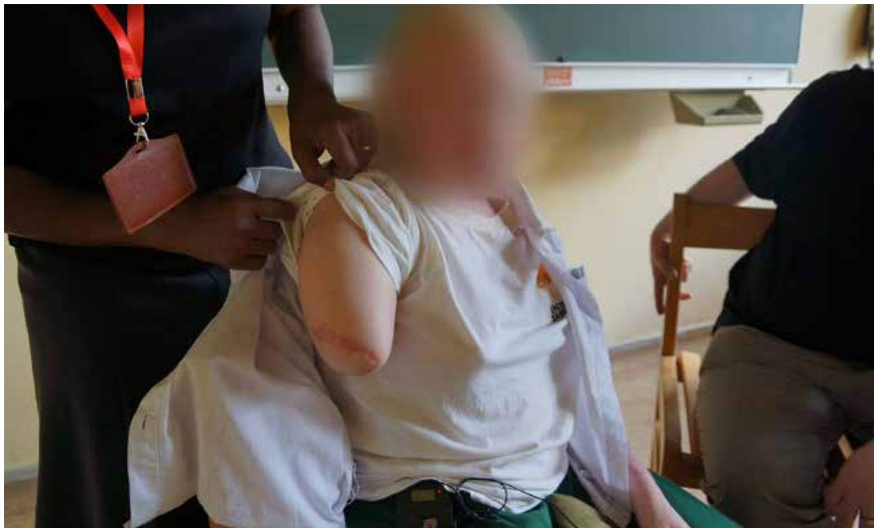
“Victim from attack”

Beyond muti and juju practices, the bodies of people with albinism are broadly believed to bring wealth and good luck and are therefore desired for use in various charms and potions. 185 People are kidnapped, attacked, murdered, and mutilated. 186 They are called derogatory terms such as “money,” “pesa,” 187 and “deal.” 188 Healers in Burundi “concoct potions” made from the limbs of people with albinism for their clients “in search of success.” 189 In Mozambique, where the hair of people with albinism is believed to be gold, there is a growing business of stealing hair. 190 In Ghana, children are sacrificed for bumper harvest or rituals related to power and riches. 191 In Tanzania, these types of myths resulted in the murder of 76 people with albinism between 2006 and 2015. 192