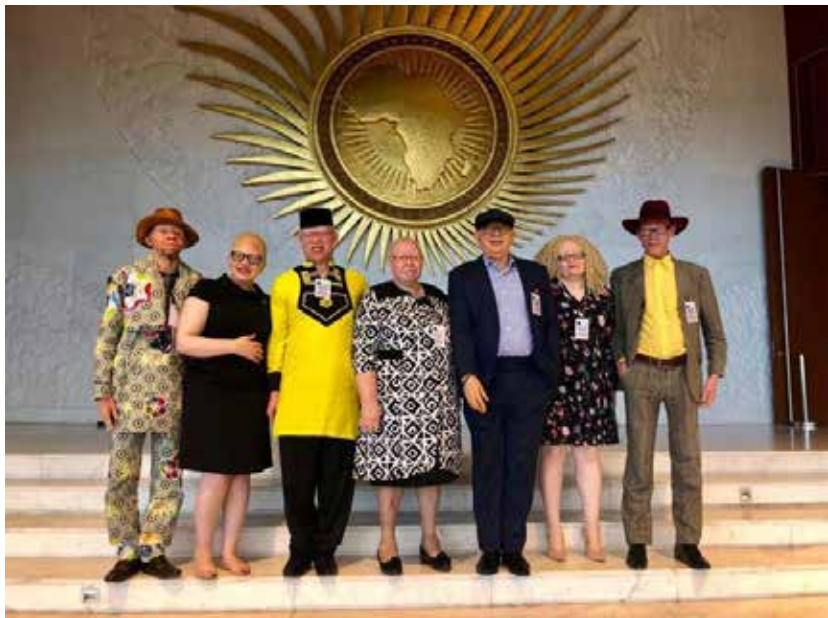
“Advocates at AU headquarters in Ethiopia”

In Tanzania, Standing Voice has developed a Vision Ambassador Training Scheme, through which 105 teachers have been trained to defend the rights of students with albinism and facilitate academic success for these students. Standing Voice has also developed a booklet on albinism and vision to help all teachers. 577