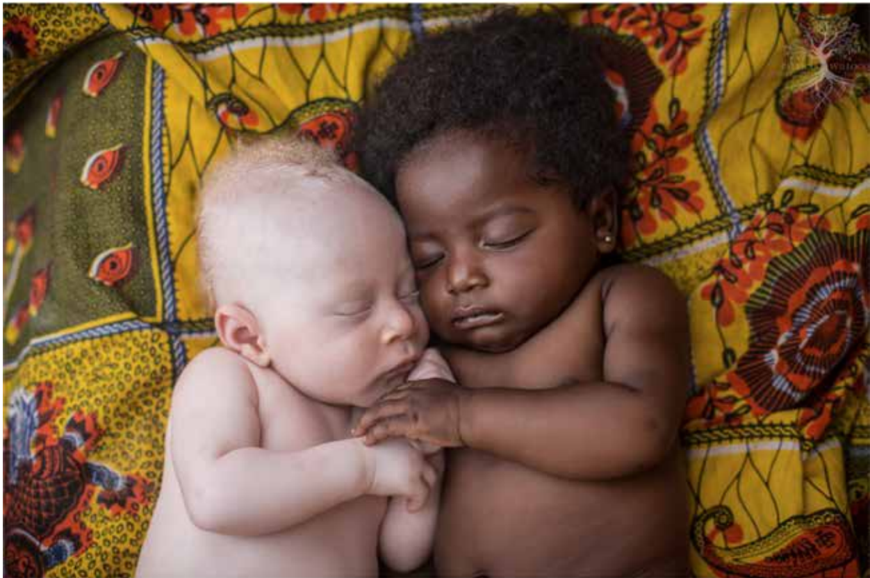
"Sleeping Babies, DRC"