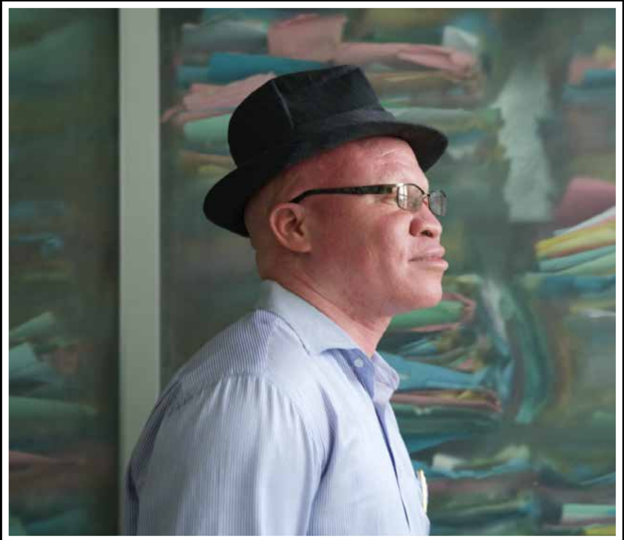
"Man from DRC"