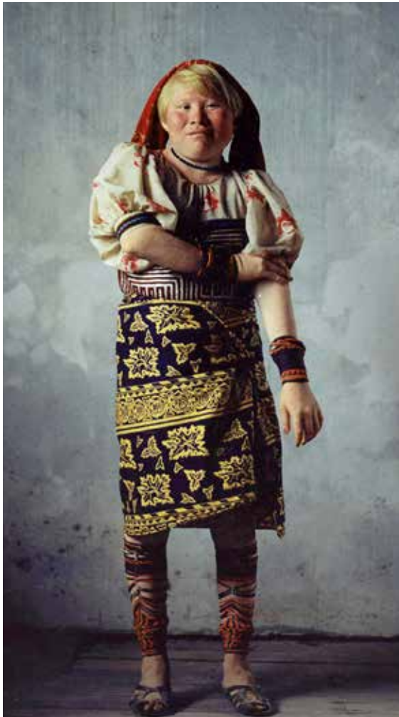
"Kuna Indian, Panama"

Albinism occurs in all racial and ethnic groups across the world, but the proportion of people affected by albinism in a given population varies by region. In Africa, the prevalence of albinism generally ranges from 1 person in 5,000 to as low as 1 person in 15,000. It has been reported that some selected populations in Southern Africa have prevalence rates as high as 1 in 1,000 people.