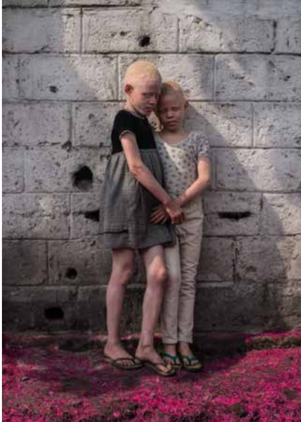
"Girls holding each other, DRC"

Women and children suffer disproportionately. The Special Rapporteur on Violence against Women has identified HPAWR as a form of violence against women. 163 For instance, myths around sexual intercourse expose women to violence, exploitative relationships, unwanted pregnancies, and sexually transmitted infections. 164 Traditional gender roles (e.g., fetching wood and water for women) and social isolation predispose women and girls with albinism to a higher risk of physical harm. 165 Women who give birth to children with albinism are also at risk of violence. 166 The ostracism and isolation of mothers of children with albinism increases the vulnerability of both mother and child to attacks. 167