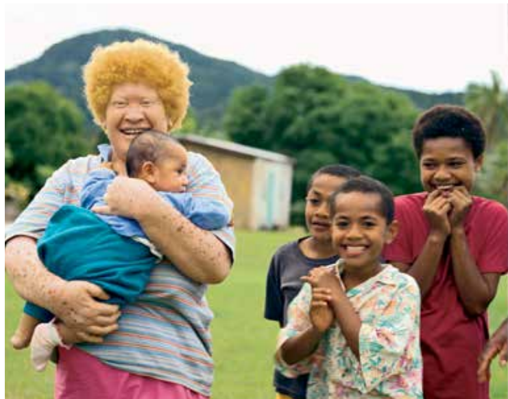
"Woman holding baby, Fiji"

The Fiji Albinism Project is governed through multisectoral coordination among civil society and the government ministries responsible for health, education, and women's issues. While the Ministry of Health provides skin and eye clinics, civil society provides free sunscreens and eyeglasses, and the Ministry of Education shares information on albinism.