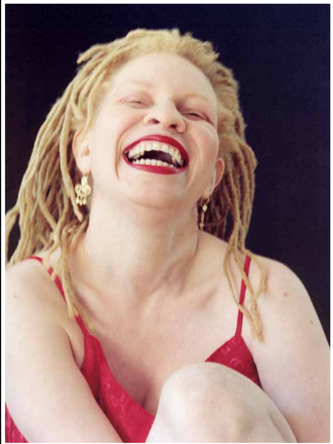
"Woman from USA" © Rick Guidotti