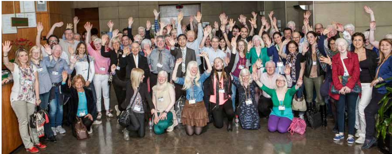
“Second European Days of Albinism Meeting”

In January, 2020, civil society groups representing people with albinism from six continents assembled in Paris, France, to lay the foundation for an international coalition to combat the attacks, stigmatization, and discrimination faced by people with albinism worldwide. By unanimous vote, these groups formed the first-ever Global Albinism Alliance.