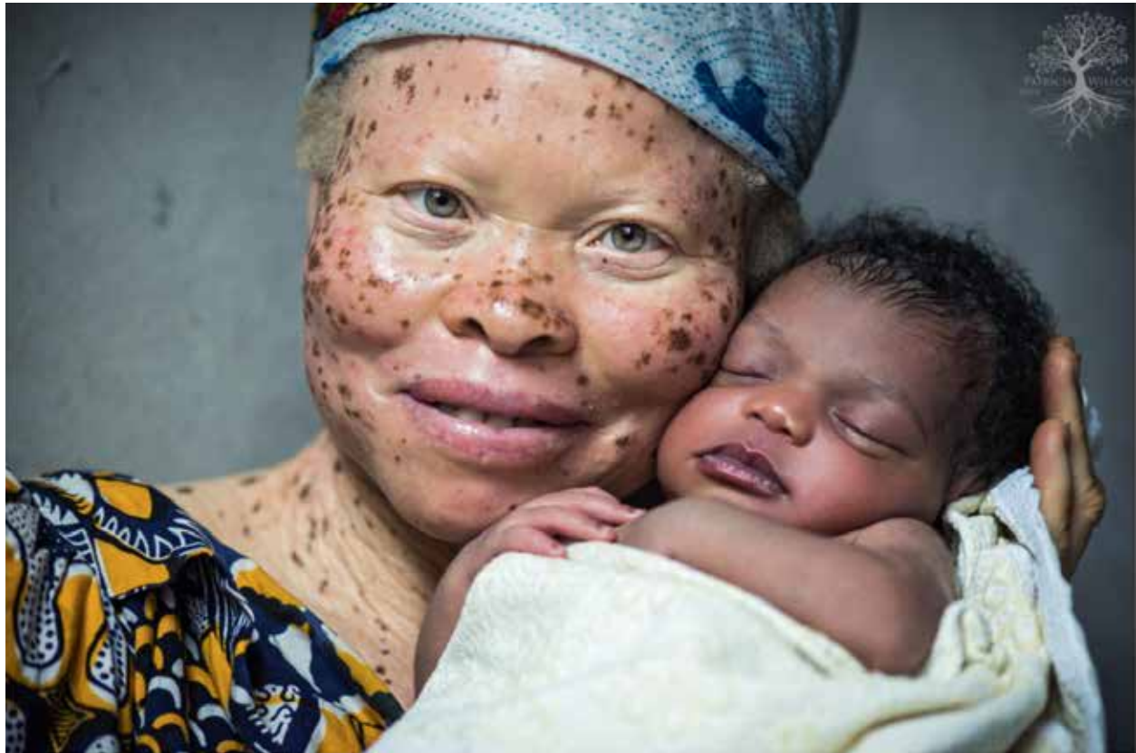
“Mother and child, DRC”

other women in the community to have children with albinism. 512 There is no legal redress for these women as against their husbands. 513