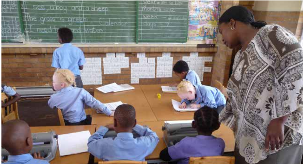
"Children in school, South Africa"