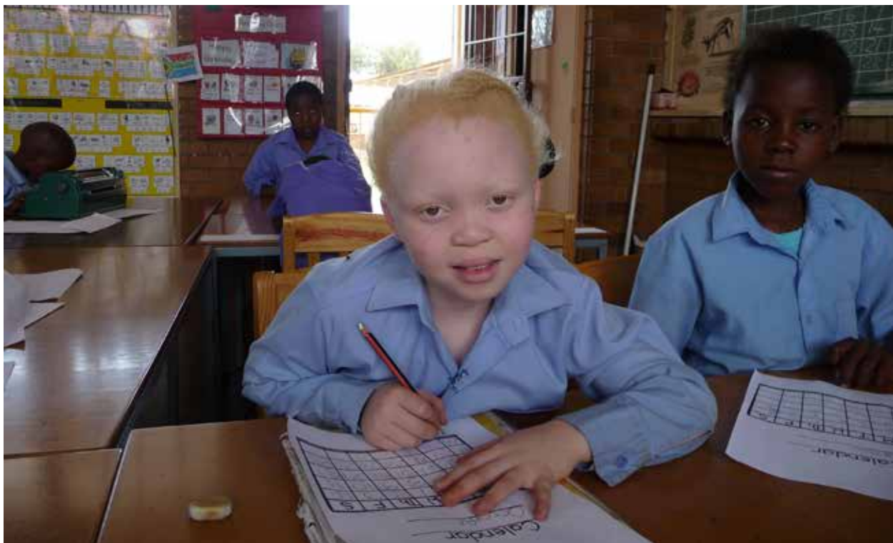
“Young student, South Africa”

States must take all measures to the maximum extent of their available resources toward the progressive realization of the right to education. In other words, States have a continuing obligation to move as quickly and effectively as possible towards its full realization. 265