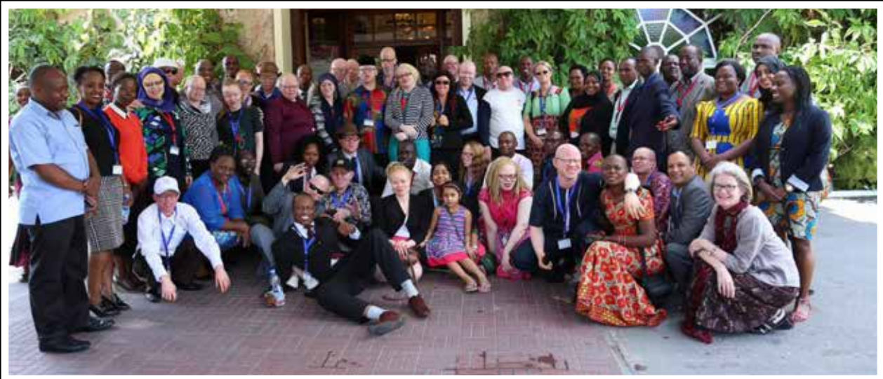
"Representatives from across Africa, Action on Albinism Forum, Dar es Salaam, 2016"