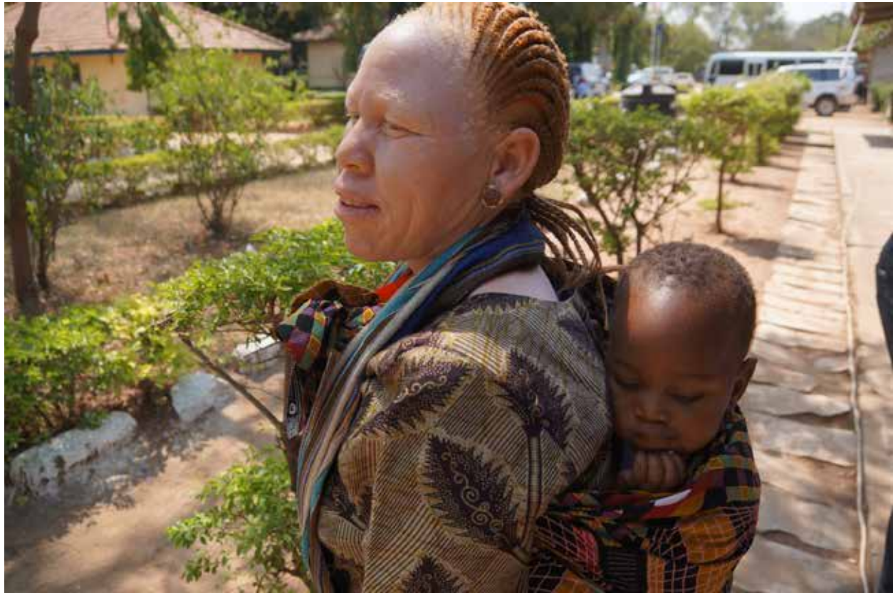
“Mother and her baby, Tanzania”

The weight of global suffering surrounding albinism is disproportionately borne by women with albinism and mothers of children with albinism.