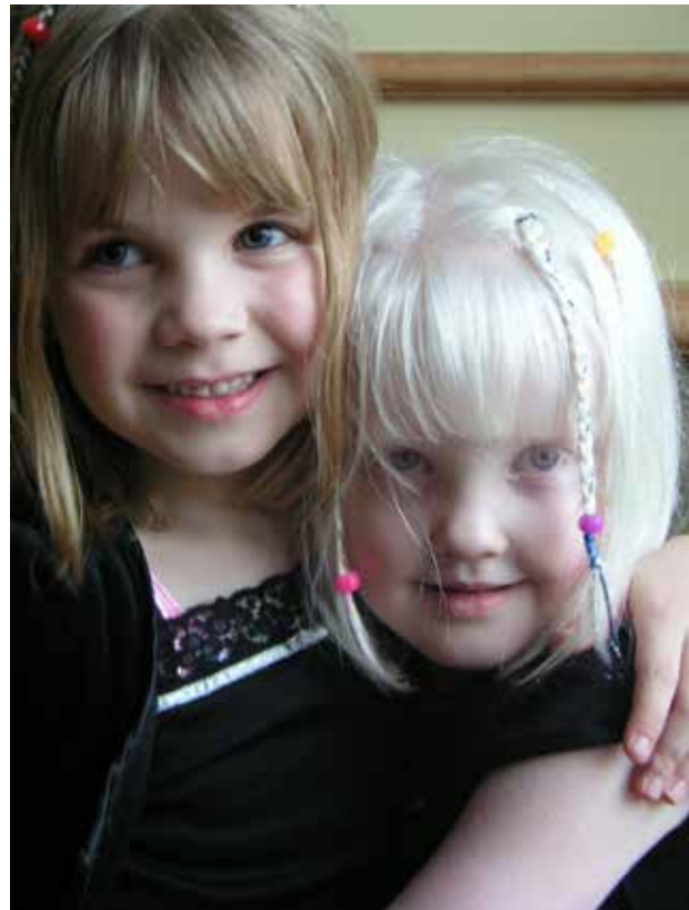
“Sisters, UK”

In much of Europe and Asia, reasonable accommodations and supports are guaranteed in law. However, in practice, students do not always receive these supports. In many European countries, for instance, accommodative devices and support are available for students with albinism through statute, 318 usually free of charge. 319 However, teachers are unaware of the needs of people with albinism as they relate to their visual impairments. 320 In Norway, the laws that ensure accommodation in school environments are difficult to navigate, and students struggle to obtain appropriate visual aids and other learning resources. 321 In Slovenia, the process to request adaptive devices can be lengthy. 322 In the United Kingdom and Ireland,