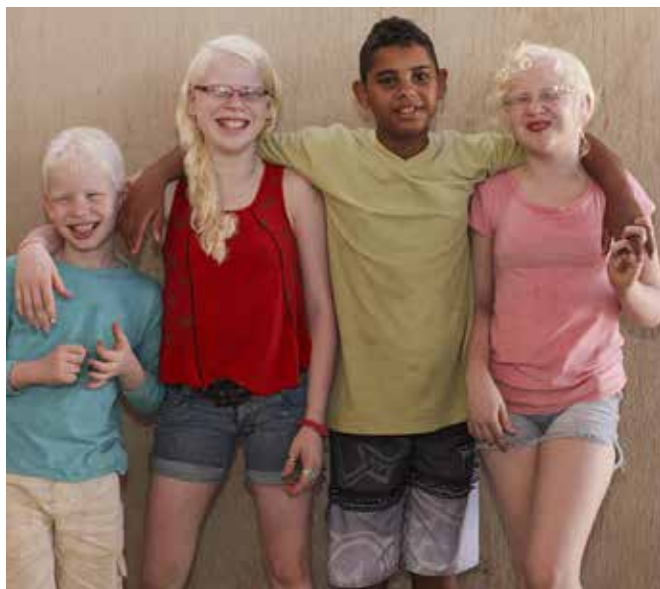
“Siblings, Brazil”

In other countries, people with albinism as a group are not barred from the disability regime, but must prove their disability on an individual basis. For example, in Brazil, there is a social security benefit programme for the elderly or extremely poor with disabilities—Benefício de Prestação Continuada (BPC) programme. Many people with albinism cannot access this programme on the basis that they do not meet the required impairment test. 123