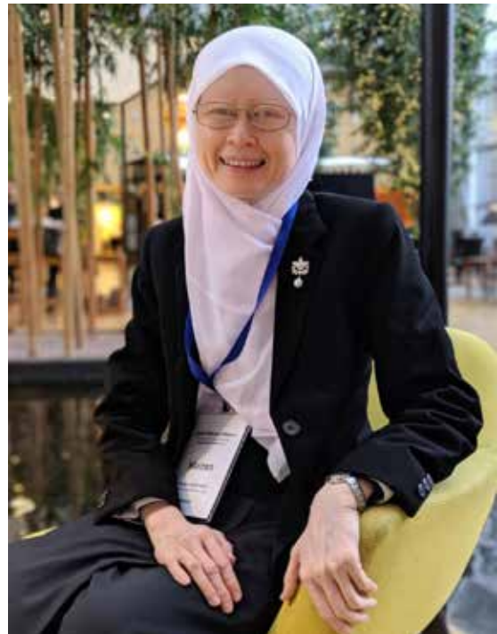
"Woman from Malaysia" © GAA

Uninformed and inaccurate decisions by medical professionals can have negative effects on other aspects of a person's life, as well. In Malaysia, for example, some jobs require people with disabilities to obtain a physician's approval to work. An assessing physician's lack of understanding regarding albinism can lead to erroneous decisions that prevent people with albinism from obtaining work. 483 In Colombia, some health professionals tell parents that their child with albinism is blind or will become blind, or that they will have a short life span and so it is not worth taking them to school. 484