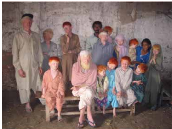
“Members of the Bhatti tribe, Pakistan”

A lack of economic accessibility is a common barrier faced by people with albinism around the world. 438 Economic accessibility means that health facilities, goods, and services, whether publicly or privately provided, must be affordable for all. 439 However, due to poverty and the high cost of products and services, health care remains inaccessible for people with albinism across the globe. Specifically, many people with albinism are unable to afford the costs of eyeglasses, contact lenses, optical aids, sunscreen and other sun protection, and screening services. 440 In the Bhatti tribe in Pakistan, people with albinism are exposed to high ultraviolet radiation but are unable to afford sunscreen or protective clothing, which leads to severe sunburns—a first step in the development of skin cancer. 441