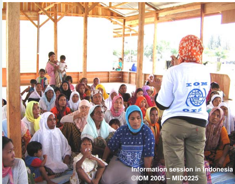
Information session in Indonesia

IOM provides information on procedures for legal migration, the costs and benefits of migration, as well as on rights, benefits and obligations of migrants. These information sessions can help reduce the risks and possible consequences of irregular migration, including trafficking and smuggling. As such, they contribute to increasing rural women's knowledge and understanding of migration channels and potentially improve their access to safe migration. For example, in Zambia, IOM supported individuals seeking information on the reality of jobs and educational opportunities with a Talk Line in operation 24 hours a day and 7 days a week. In Kenya, with IOM's support, the Ministry of Labour has included information on employment agencies on its website. Ensuring that aspiring migrants have access to valid and official travel documents is also an important step in encouraging legal migration. In Zimbabwe, IOM built the capacity of key government departments responsible for the provision of birth certificates, ID, passports, emergency travel documents and visas to ensure Zimbabweans, including women, have access to official travel documents. In addition, women and girls have received information on procedures to obtain these documents.