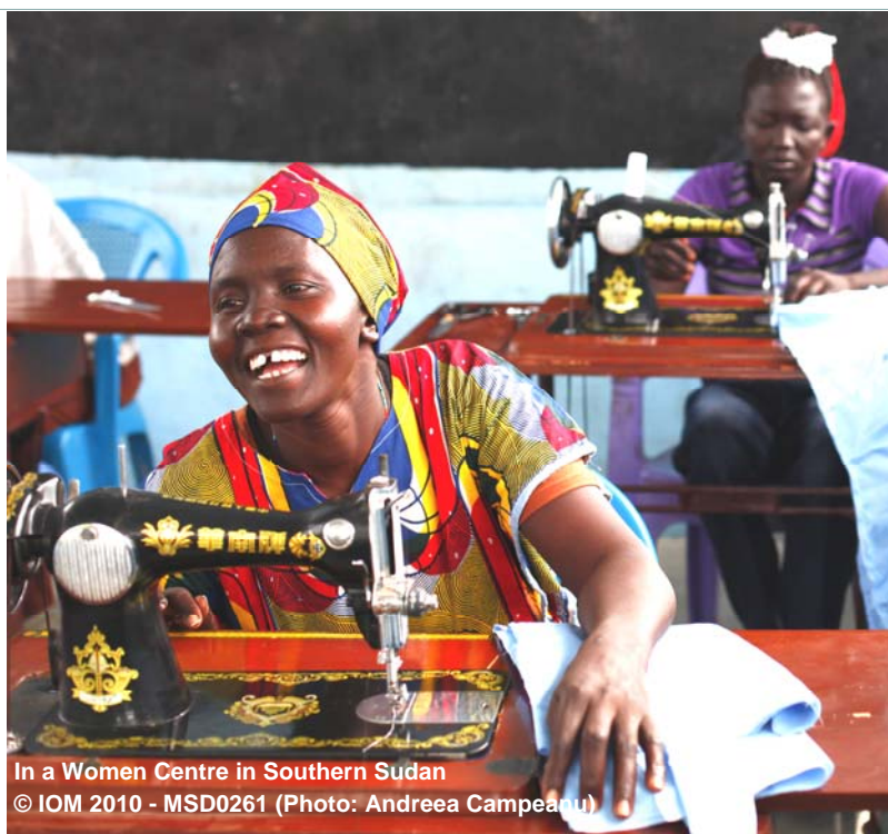
In a Women Centre in Southern Sudan

2010 Engendering Rural Women Migrant Returnees in Contemporary China . Available from www.ceauk.org.uk/2010-conference-papers/full-papers/Nana-Zhang-CEA-final.pdf .