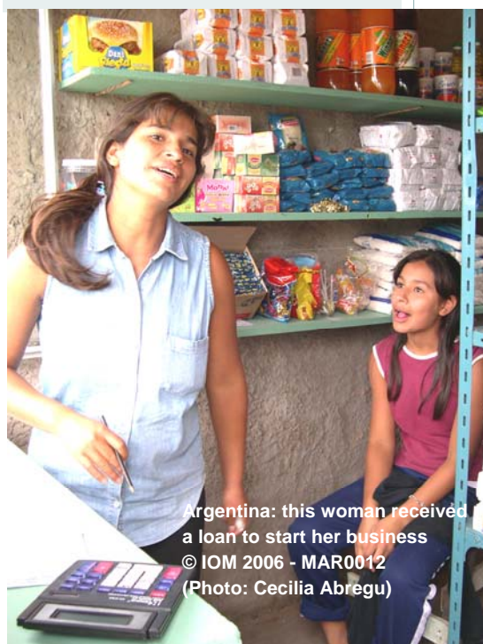
Argentina: this woman received a loan to start her business

The struggle for women-headed households can be particularly trying when women are left to deal with increased workload and responsibilities, but without equal or direct access to financial, social, and technological resources (World Bank, 2009). For instance, rural women heads of household may confront de jure or de facto discrimination regarding land and property ownership and tenure, or access to credit. Legal reforms in these areas will go a long way towards bringing about food security for many communities (Economic Commission for Africa, 2004). Also, despite a clear trend towards the feminization of agriculture, farming equipment continues to be designed for men, forcing women to use tools that are inadequate in weight or size (World Bank, 2009).