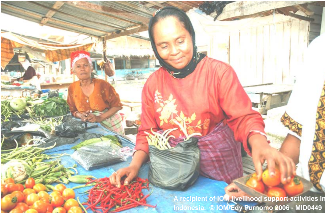
A recipient of IOM livelihood support activities in Indonesia. © IOM/Edy Purnomo 2006 - MID0449

may not be a sufficient condition alone to promote the economic empowerment of women left behind. Thus, it is critical for remittances to be linked to local investment schemes, training and financial literacy programmes. For example, remittances should be used as a lever to move away from subsistence agriculture and increase food security for households headed by women.