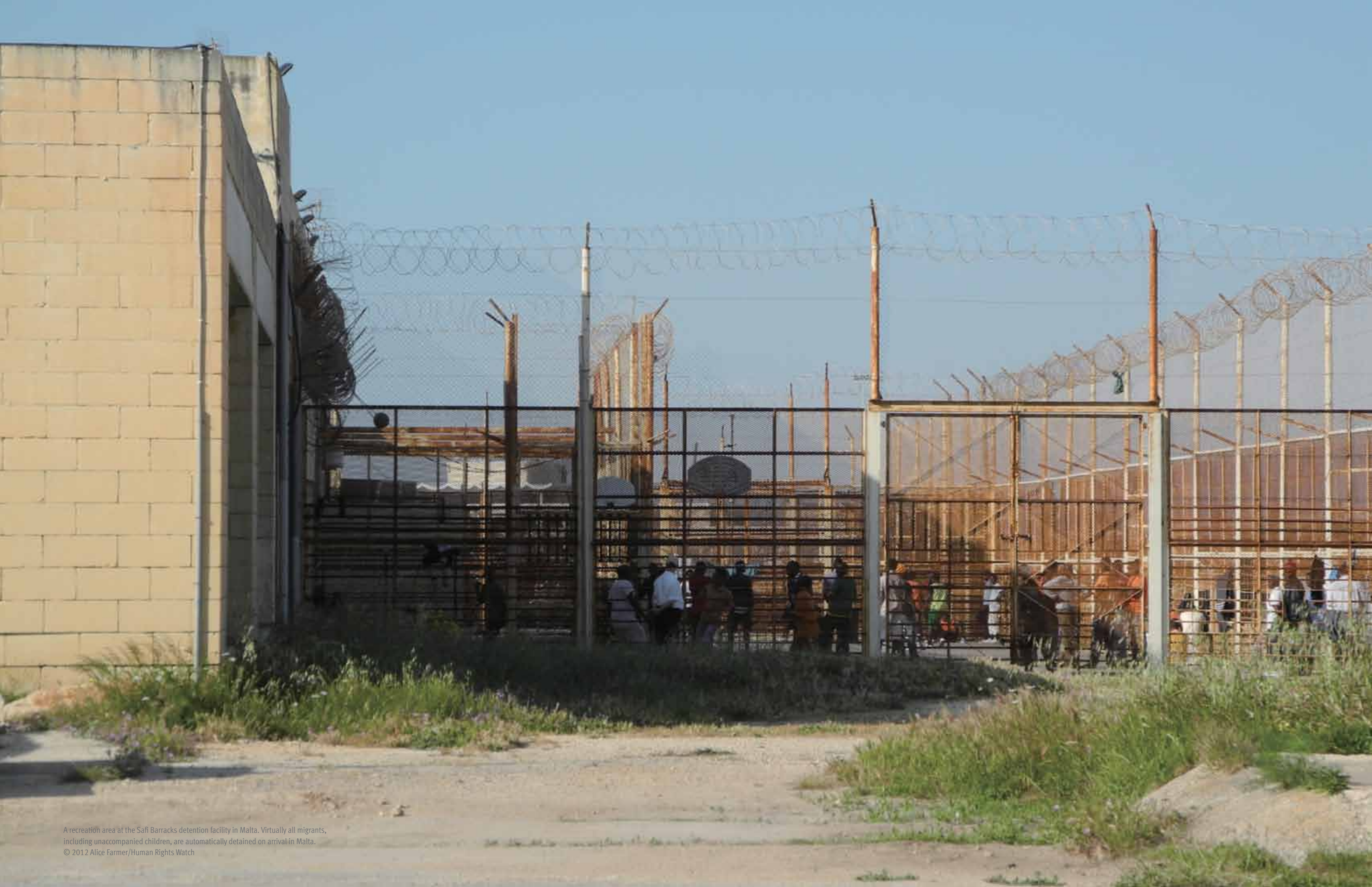
A recreation area at the Safi Barracks detention facility in Malta. Virtually all migrants, including unaccompanied children, are automatically detained on arrival in Malta.