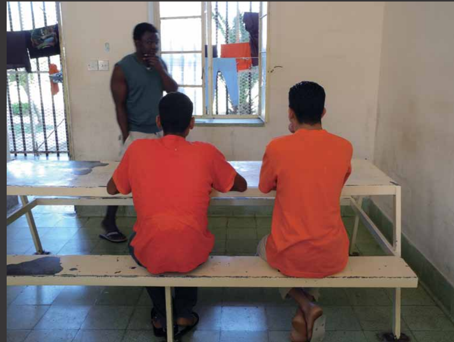
A 15-year-old and a 16-year-old in an adult detention facility. Upon arriving in Malta, they were detained with adults pending an age assessment procedure to establish them officially as minors.

Systems that prevent unaccompanied migrant children from accessing their rights in Europe are not necessarily the result of sophisticated legal regimes. Legal gaps that either target unaccompanied migrant children—or hit them as “collateral damage”—may be blunt and discriminatory. For example for years the United Kingdom was criticized for excluding migrant children from the full entitlements under the CRC due to their migration status until it lifted a reservation in 2008, announcing its move days before the United Nations was set to evaluate its children's rights record. 14