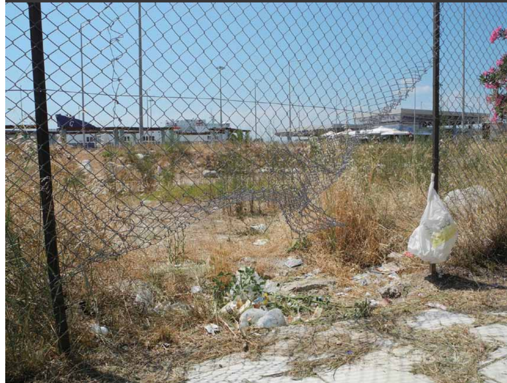
A hole in the fence surrounding the port at Patras, Greece; migrants use holes like these to enter the port and stow away on ships.