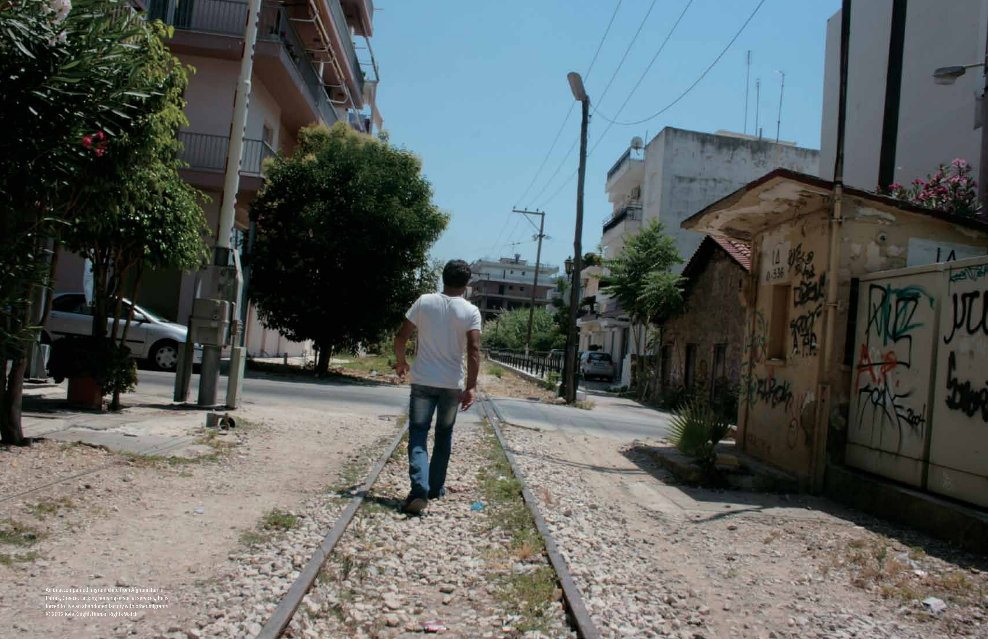
An unaccompanied migrant child from Afghanistan in Patras, Greece. Lacking housing or social services, he is forced to live in an abandoned factory with other migrants.