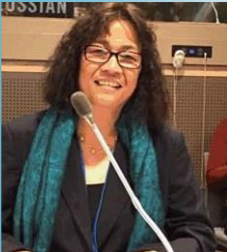
Delegate HRC 34 (February - March 2017) Capital Without a Permanent Mission in Geneva