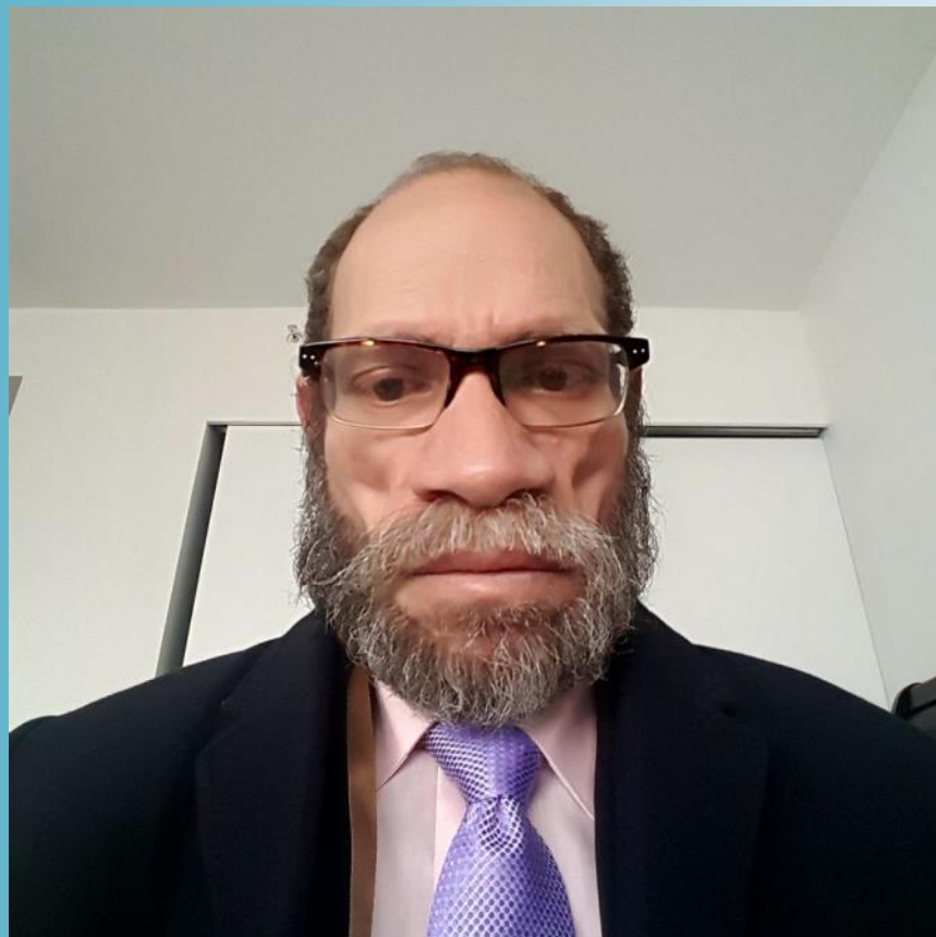
Delegate HRC 32 Universal Session June 2016 HRC 34 (February - March 2017) New York Without a Permanent Mission in Geneva