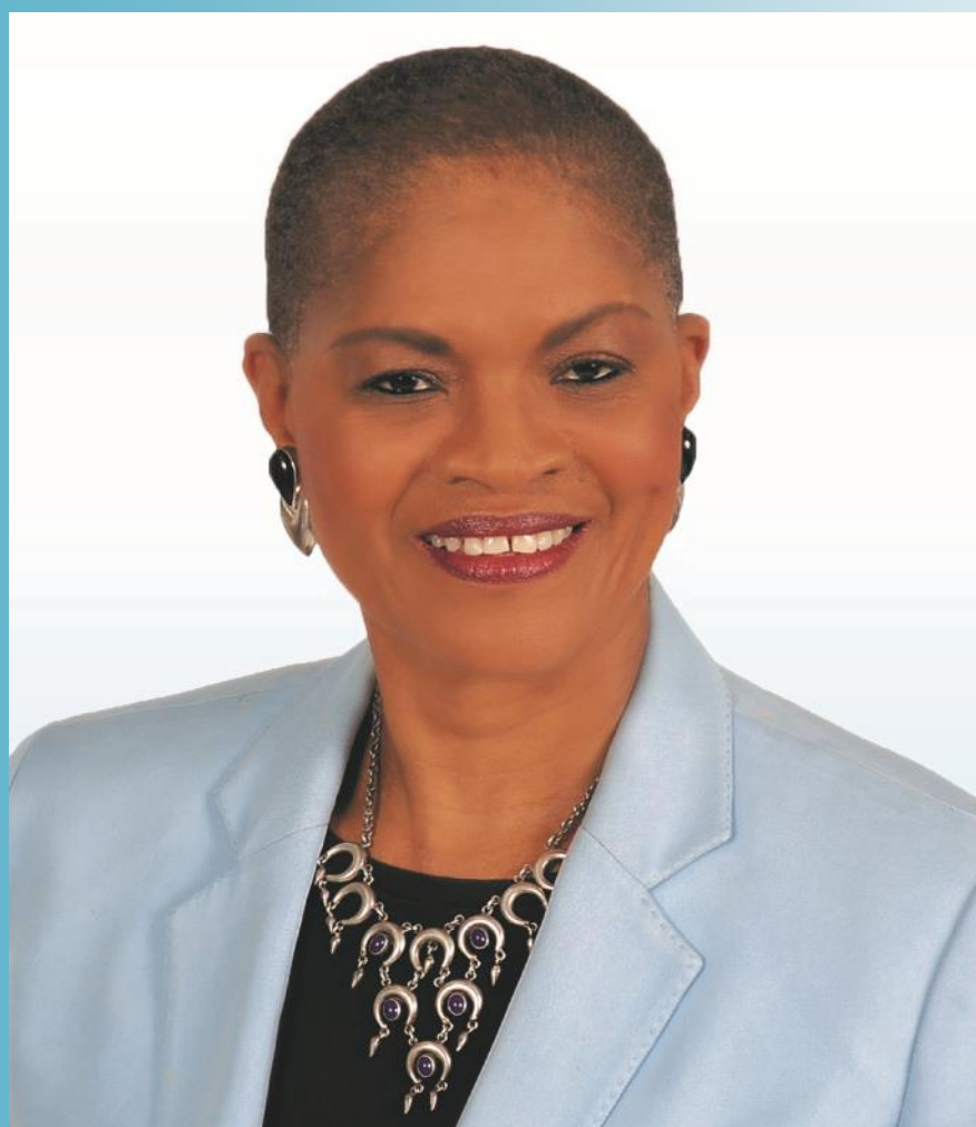
HRC 32 Universal Session (June 2016) New York