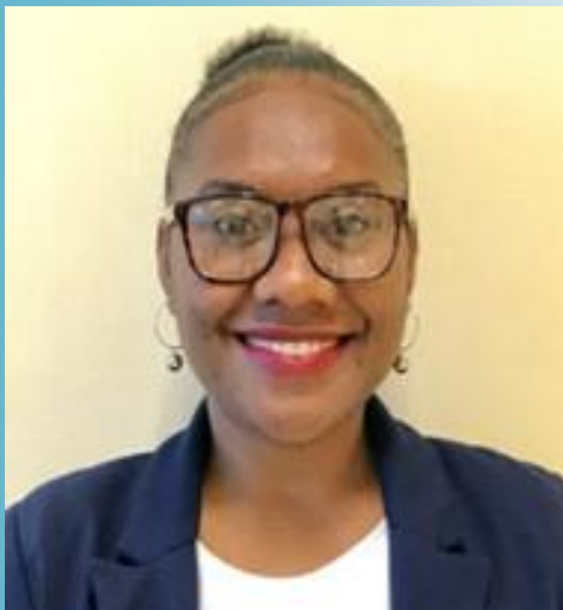
Delegate HRC 41 (June-July 2019) Capital Without a Permanent Mission in Geneva