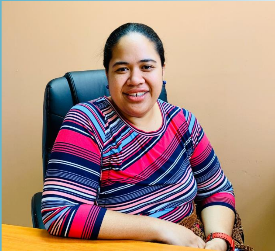
Delegate HRC 32 Universal session (June 2016) Capital Without a Permanent Mission in Geneva