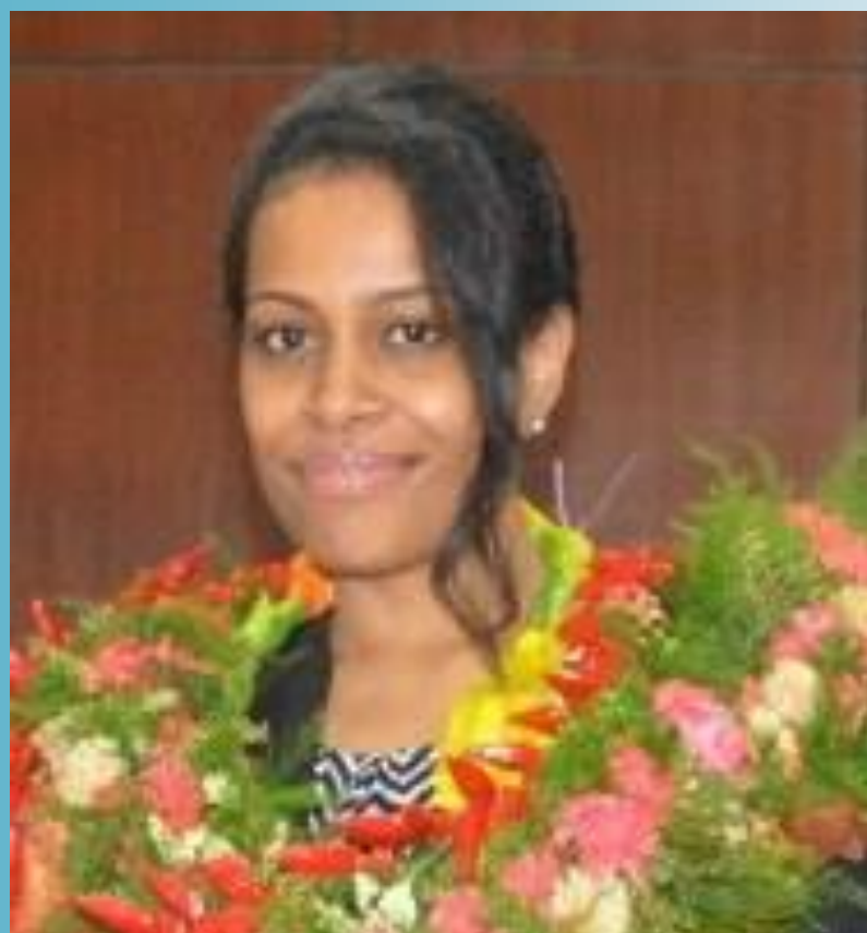
Fellow 2017 Capital Without a Permanent Mission in Geneva