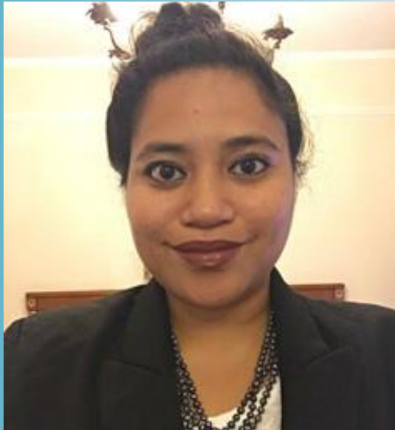
Delegate HRC 39 (September 2018) Capital Without a Permanent Mission in Geneva