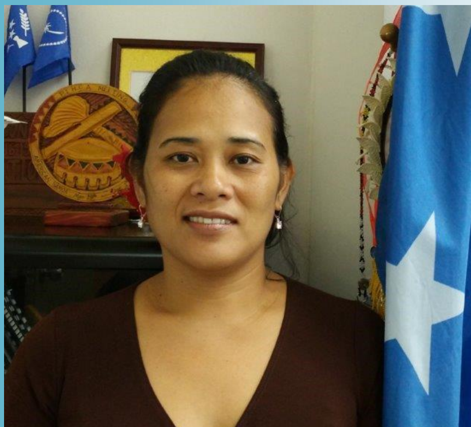
Delegate HRC 34 (February - March 2017) Capital Without a Permanent Mission in Geneva