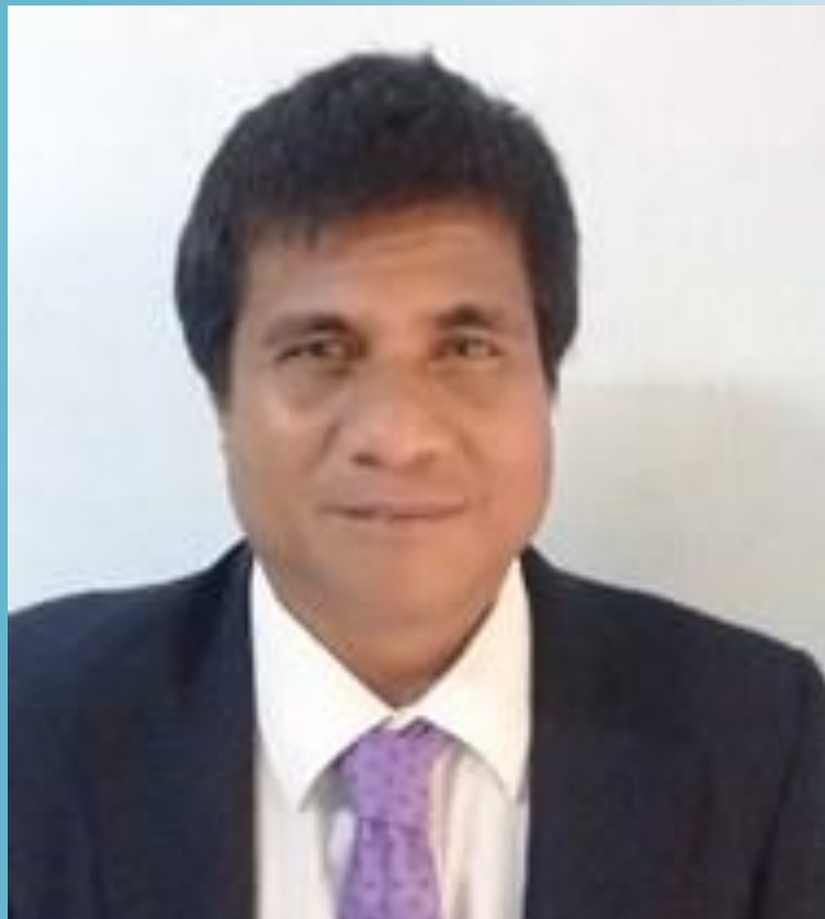
Delegate HRC 41 (June-July 2019) Capital Without a Permanent Mission in Geneva