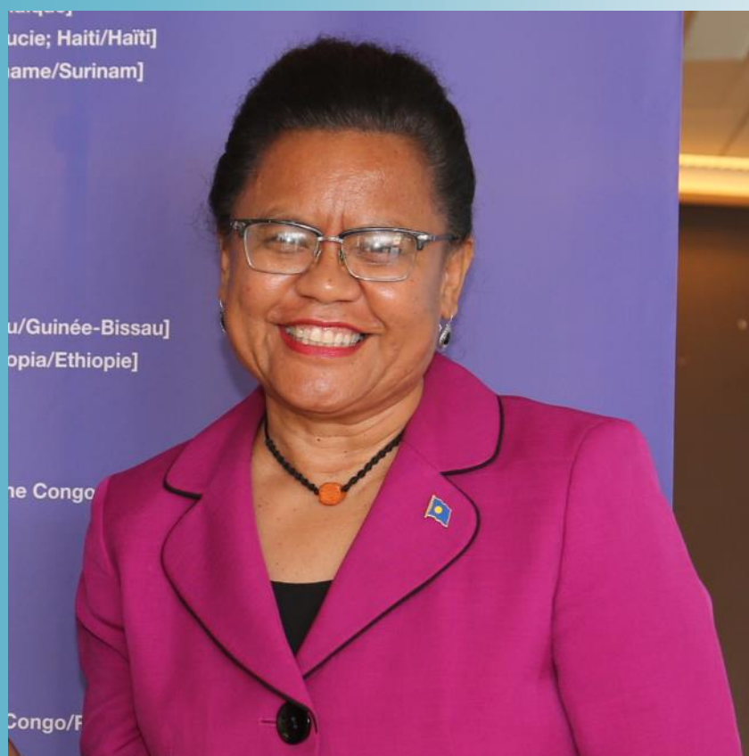
Delegate HRC 41 (June - July 2019) Capital Without a Permanent Mission in Geneva