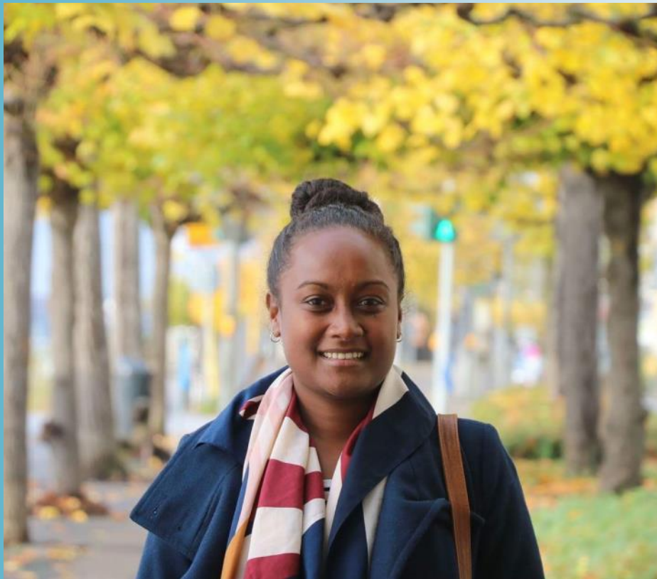
Fellow 2015 Capital