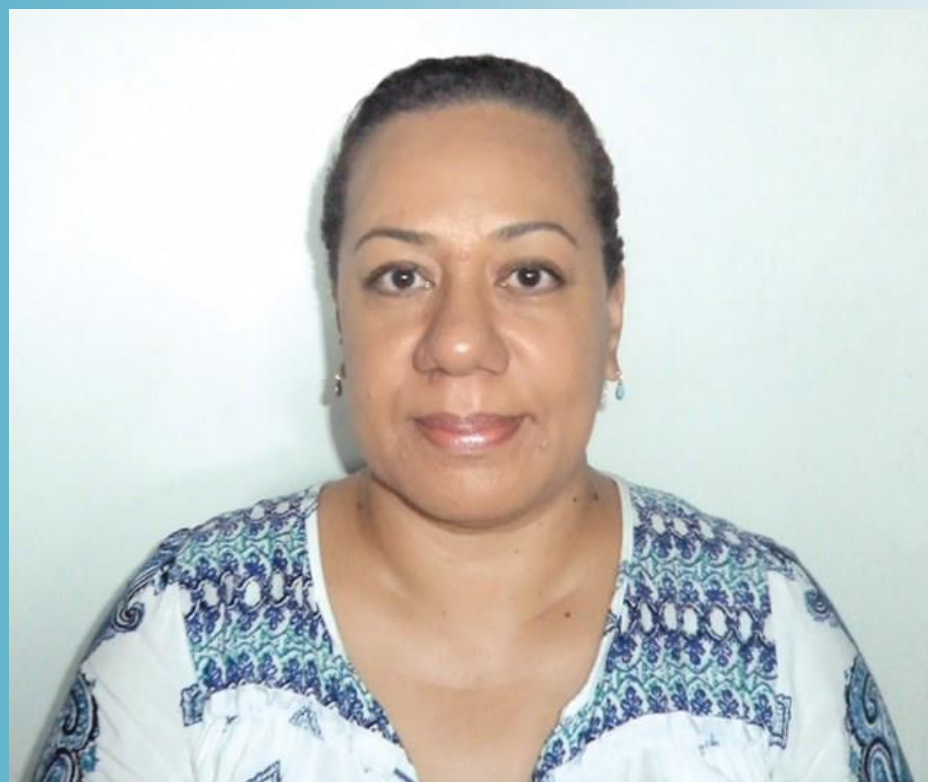
Delegate HRC 34 (February -March 2017) Capital Without a Permanent Mission in Geneva