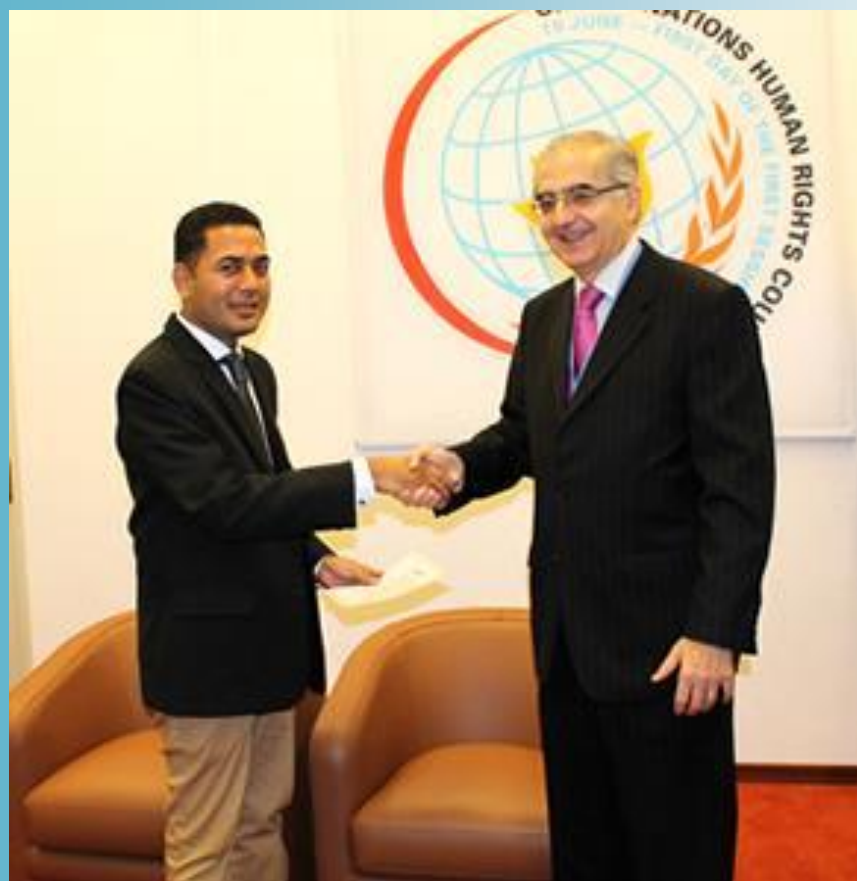
Fellow 2014 Capital Without a Permanent Mission in Geneva