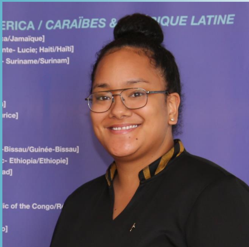
Delegate HRC 41 (June -July 2019) Capital