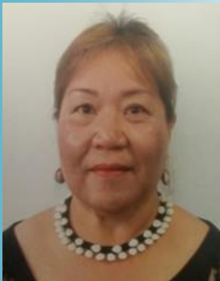
Delegate HRC 32 Universal Session (June 2016) New York Without a Permanent Mission