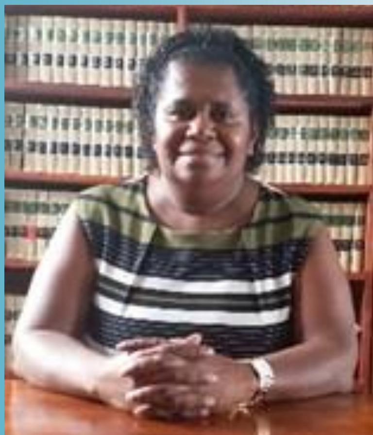
Delegate HRC 41 (June - July 2019) Capital