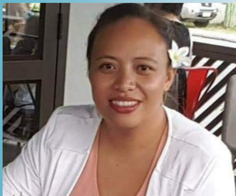
Delegate HRC 31 (February - March 2016) Capital Without a Permanent Mission in Geneva