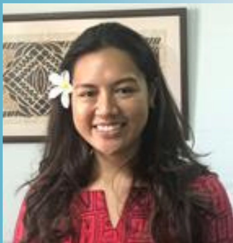
Delegate HRC 40 (February - March 2019) Capital Without a Permanent Mission in Geneva