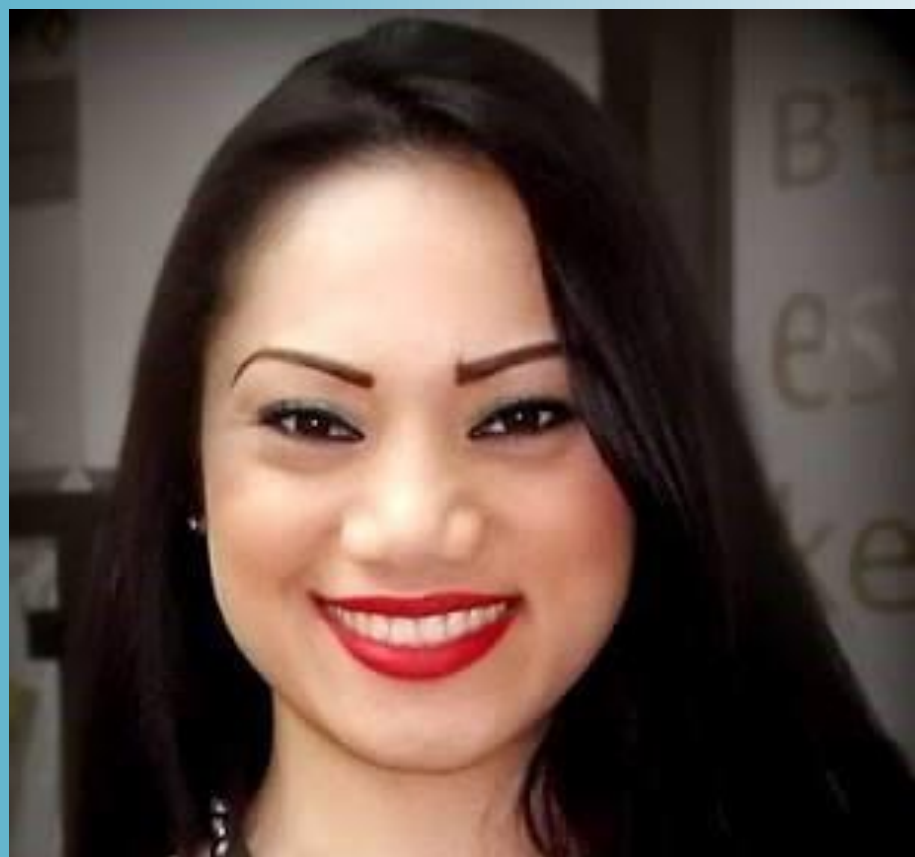
Delegate The 100 th Beneficiary Delegate of the Trust Fund HRC 38 (June 2018) Capital Without a Permanent Mission in Geneva