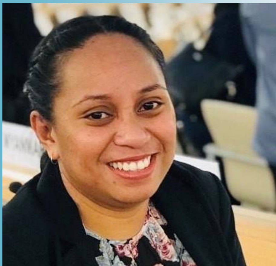
Delegate HRC 41 (June - July 2019) Capital