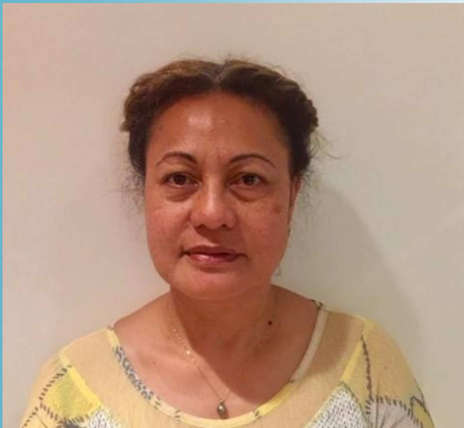
Delegate HRC 32 (June 2016) New York Without a Permanent Mission in Geneva