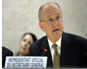
John Ruggie Special Representative of the UN Sec-Gen (SRSG)