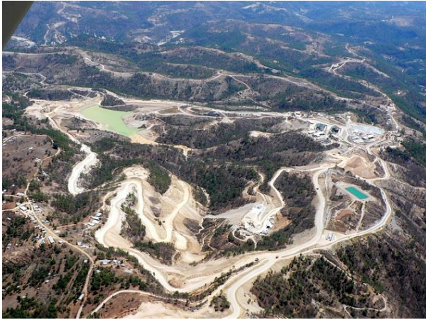
Photo Credit: Sipacapa and San Miguel Ixtahuacan, San Marcos Guatemala; This is an aerial shot of the mining company's operations, which cause destruction of biodiversity, contamination of water by cyanide, natural resources, etc..

Marlin 1 open pit strip mine, which uses highly toxic sodium cyanide for ore extraction, is located in the Indigenous municipalities of Sipacapa and San Miguel Ixtahuacán and has been the focus of controversy and opposition by local communities since it was established in 2004.