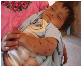
Photo Credit: Sipacapa and San Miguel Ixtahuacan, San Marcos Guatemala; This is a photo of a child with disease of the skin, similar to many women and children who live in proximity to the area of gold and silver exploitation.

The nearby Mayan Indigenous communities report contamination of ground water affecting food production, chronic illnesses among the children, persistent skin diseases and liver cancers, forced displacement of families and political repression of protesters. Communities have consistently expressed strong opposition through a number of formal and well-documented referendums which have been consistently ignored and disregarded by both the Guatemalan and Canadian governments.