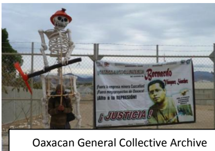
Oaxacan General Collective Archive

Recognized in the Universal Declaration of Human Rights (Articles 8, 9, and 10); the American Convention on Human Rights (Article 25); the Declaration on the Right of Individuals, Groups and Organs of Society to Promote and Protect Universally Recognized Human Rights and Fundamental Freedoms Article 9.5); and the Political Constitution of the United Mexican States