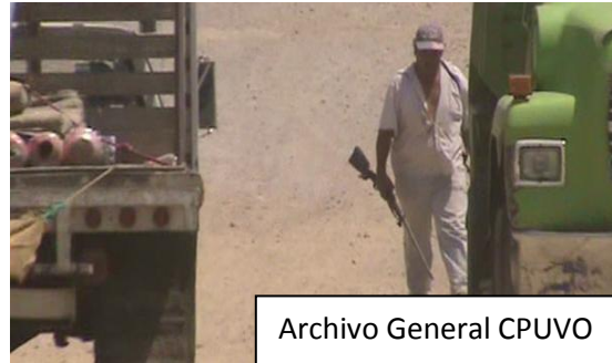
Archivo General CPUVO