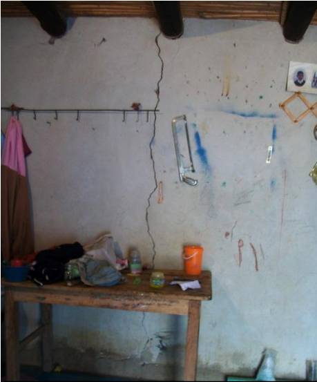
Civilian Observation Mission Archive