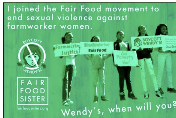
Image of the Fair Food Sisters Twitter movement to end sexual assault against farmworker women. 41

For decades, the women who harvest fruits and vegetables in the U.S. have endured sexual violence in the fields. A 2012 study conducted by Human Rights Watch indicates “80% of female farmworkers report facing sexual harassment on the job.” 39 Women are often fired for speaking up against sexual violence in the workplace while the abuser remains on the job. In 2015, the Equal Employment Opportunity Commission announced a $17 million judgment against Moreno Farm Florida and in favor of farmworkers who were regularly groped, prostituted, and raped by the farm owners’ two sons and a third supervisor. 40 The lack of incentives and aid provided by the government to victims of sexual violence in the field perpetuates their inability to seek redress and allows these abuses to remain in the dark, while offenders escape liability for malicious crimes.