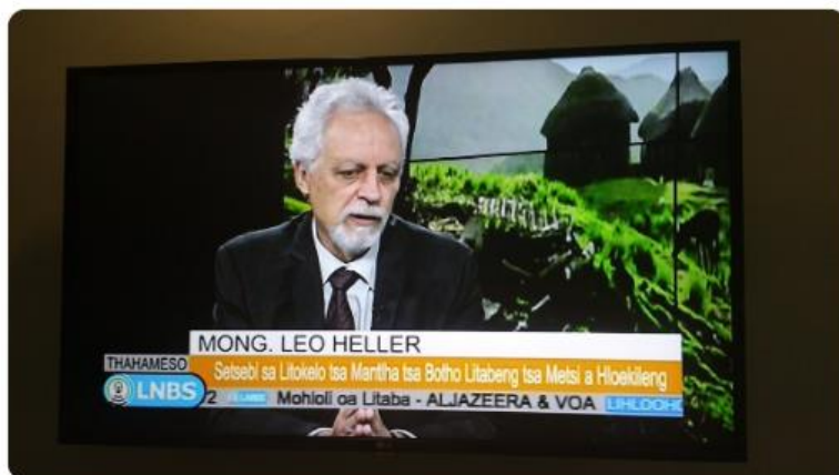
UN-Water, unicef Lesotho and UN Lesotho

The press conference will be livestreamed at facebook.com/srwatsan at 10 am local time in Maseru.