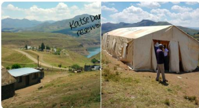
UN-Water, unicef Lesotho, UNICEF Water et 3 autres

Léo Heller, UN Special Rapporteur @SRWatSan · 10 févr. DAY 6 in Tosing, district of Quthing #Lesotho.