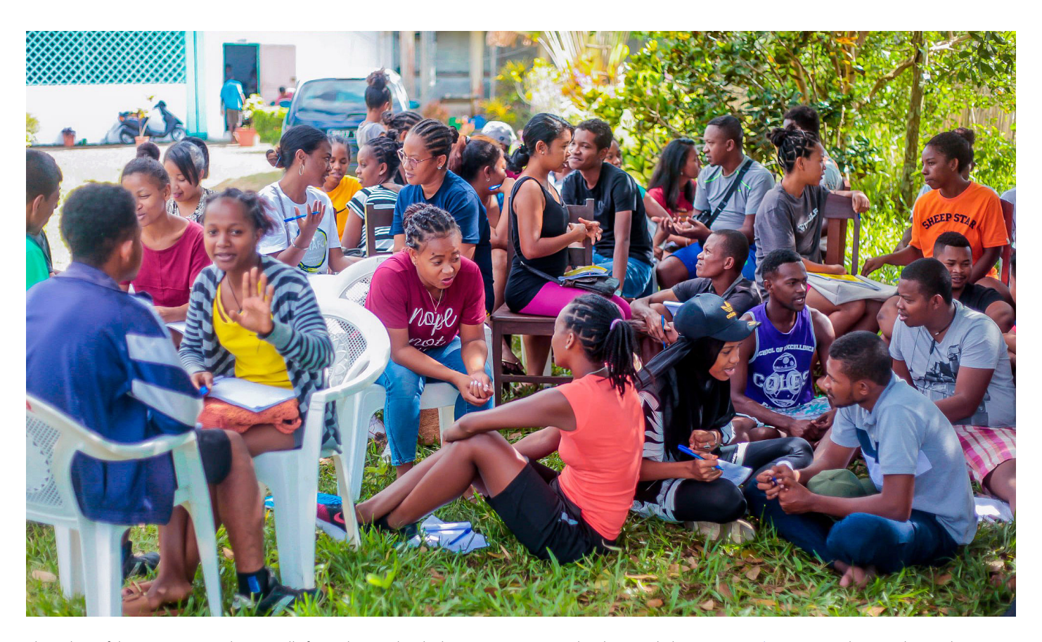
Thirty-three of the projects were either centrally focused on youth or had a strong component related to it, including project PBF/IRF-382 in Madagascar that used mentoring and engagement to support university students, young journalists, and civil society members and other youth to be promoters of human rights and peace.

Although the GYPI offers an important avenue for encouraging projects focused on gender and youth dimensions, projects approved through other funding modalities and windows may also focus significantly on gender and youth.