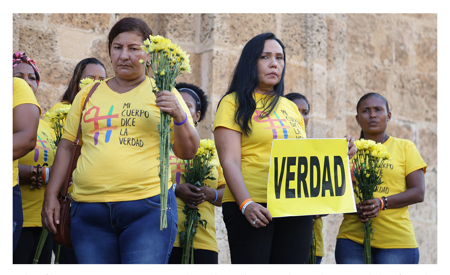
Key themes of the 2016 peace agreement were to encourage transitional justice and accountability processes, and to increase the participation and inclusion of women. These themes were strongly represented in PBF-supported projects in Colombia, including in the PBF/COL/C-1 project depicted above, supporting women to participate in the activities of the Truth Commission.

In June 2022, Colombia elected its first left-wing president, Gustavo Petro. Petro came to power with promises to bring about peace in part through full implementation of the 2016 agreement, including its human rights-centred objectives. In late 2022, he attempted to expand the peace process by proposing separate peace talks with other armed groups beyond the FARC (sometimes referred to as the "Total Peace" strategy).