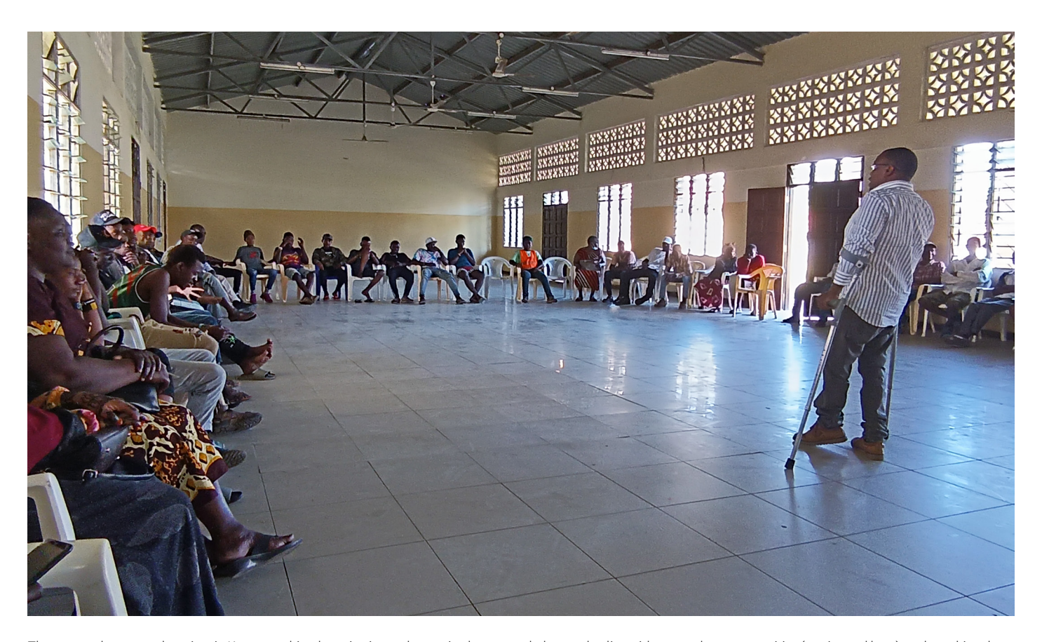
The counter-hate speech project in Kenya combined monitoring and removing hate speech detected online with outreach to communities (as pictured here), and synching these activities with a nationally coordinated early warning system and action plan.