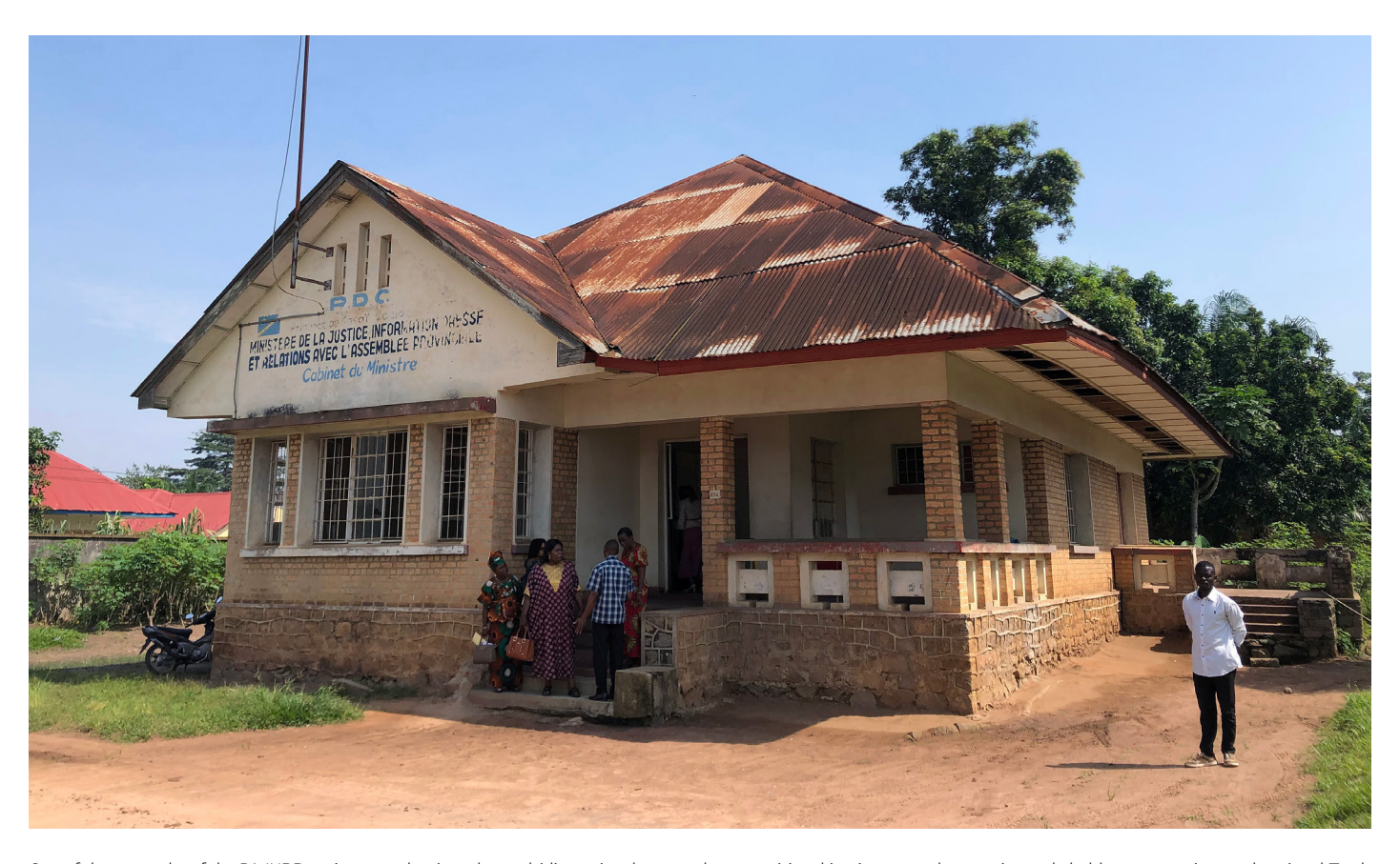
One of the strengths of the PAJURR project was that it took a multidimensional approach to transitional justice, not only engaging stakeholders on creating a subnational Truth Commission, but working with local Ministry of Justice officials (as depicted in this photo) to improve access to justice through regular judicial processes.

more harmonious return process, defusing tensions that might arise either among host communities or returnees.<sup>208</sup> This latter component proved extremely important in achieving some of the overall project goals of reinforcing social cohesion and sustaining peace in the region. The voluntary returns unfolded in a relatively peaceful way, which many interviewees said was surprising given the conflict history.<sup>209</sup> In assessing outcomes, it is difficult to attribute the relatively smooth return and reintegration of ex-combatants in the Kasaïs to the SSKAT interventions alone. There were many contextual factors at play, including the decentralized nature of the Kamuina Nsapu militia groups, which perhaps did not present the same demobilization difficulties as more cohesive or enduring armed groups. However, interviewees observed that these socioeconomic interventions provided space to build social cohesion, thus easing tensions that may have otherwise set the peace process back.