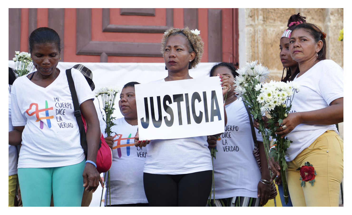
The three projects related to the Truth Commission in Colombia – including outreach efforts to involve those affected by the conflict, as depicted in the photo above – were impactful in part because the sequential or iterative nature of the funding allowed them to build momentum and adapt programming to the evolving peace and security context in Colombia.

Iterative or sequential projects might also be appropriate to consider in situations where there are particular opportunities for change. Within human rights work, progress often does not proceed in a linear fashion. However, there are certain moments that provide windows of opportunity. For example, at critical transition moments following an election, or at certain points in political transition processes - politics may shift in ways that open opportunities to advance right issues. In some cases, such windows may become available only following major political developments or external demands. One cross-border project in CAR and Cameroon (PBF/IRF-375; PBF/IRF-376), related to addressing trafficking in persons, provided one such example. Following the threat of external donor funding cuts, the Government of the CAR focused on addressing human trafficking - a widespread practice that had long generated substantial human suffering and deprivations of rights for citizens of CAR, while also contributing to the resources of illegal armed groups. This created an opening for new legislation and policies prohibiting trafficking, as well as for greater attention to enforcement. The project was further enabled by cooperation with one of the common receiving countries, Cameroon.