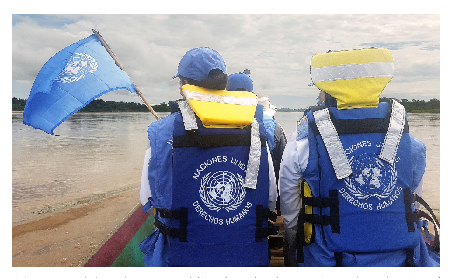
The three iterative projects related to the Truth Commission supported the full range of activities of the Truth Commission, including outreach and consultation with victims of past violence and in conflict-affected areas, as captured in the photo above.

The first of the three projects supporting the Truth Commission, PBF/COL/A-3, enabled the Commission to be established, providing support for personnel and any other resources or capacities needed. The second, PBF/COL/C-1, supported the next stages of the Truth Commission's mandate and activities, including support for evidence-gathering and research, efforts to reach out to those in remote areas, as well as activities to support the Commission's Final Report. The third, PBF/COL/A-5, (which was ongoing at the time of research) supports dissemination and awareness of the Final Report, particularly among rural communities. It also supports a "Monitoring Committee" tasked with ensuring that the recommendations are realized in policy and in practice.