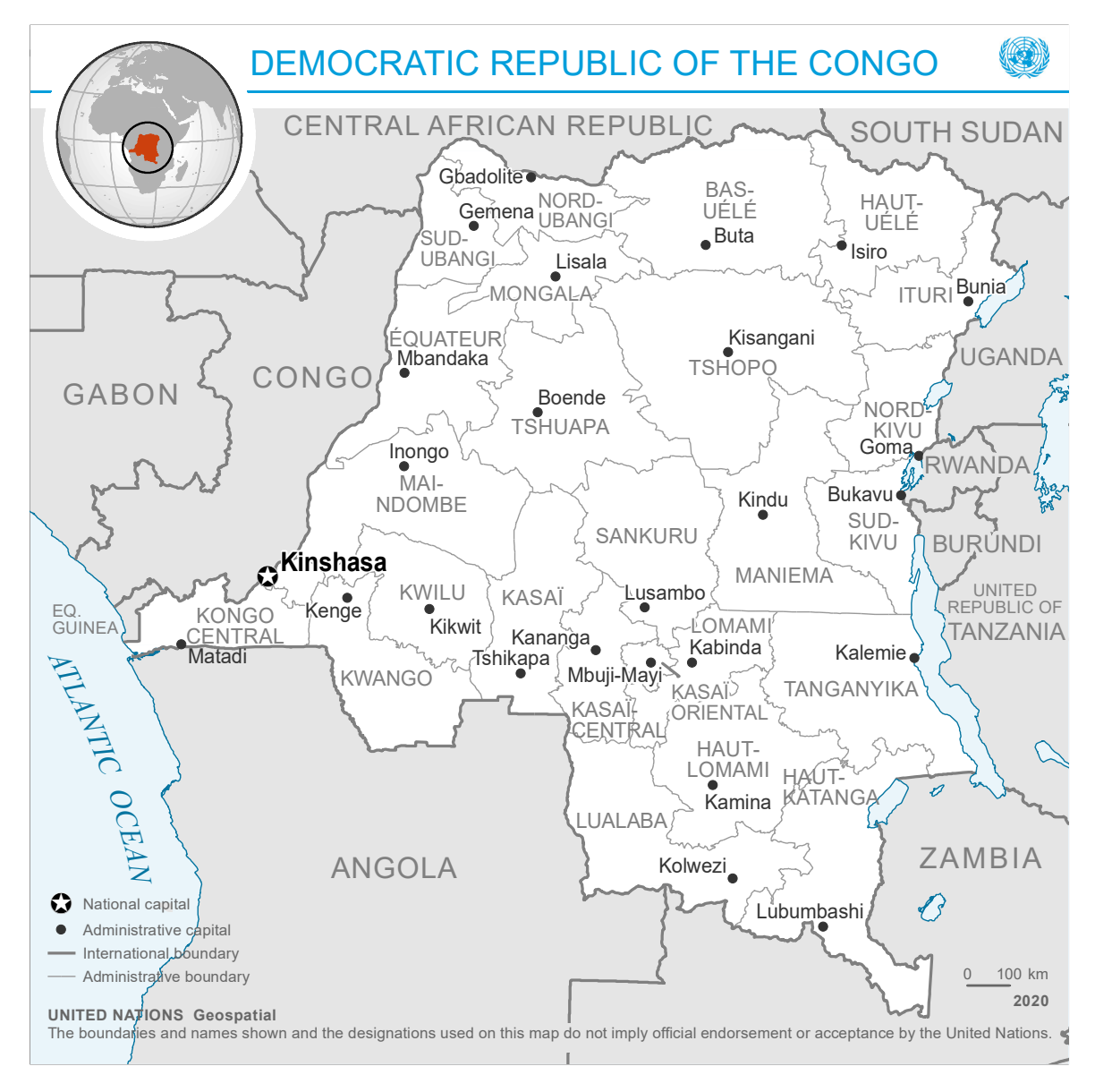
Figure 4: Location of Projects in the DRC Case Study

The projects PBF/COD/C-1 (PAJURR), PBF/COD/B-7 (SSKAT), and PBF/IRF-405 were all implemented in the greater Kasaï region (including Kasaï and Kasaï-Central). SSKAT also had activities in Tanganyika. The project PBF/IRF-405 took place in South Kivu (Sud-Kivu).