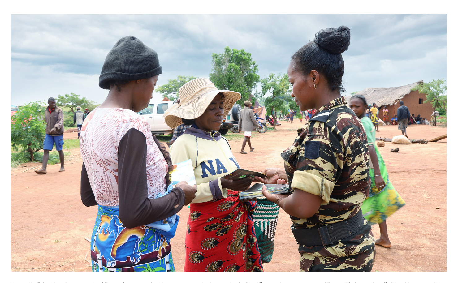
Some 30 of the 92 projects examined focused on strengthening government institutions, including efforts to improve accountability and link security officials with communities, as in the <a href="https://pxpc.ncb/PBF/MDG/B-2">PBF/MDG/B-2</a> project in Madagascar.

Perhaps because of this siloing or self-identification issue, many of the projects examined that related to fields strongly associated with human rights - for example, HRDs, NHRIs, GBV and GEWE, and community protection - did not clearly articulate how the programmes advanced peacebuilding objectives or goals. This may suggest a gap in the field, with projects that would be strong examples of human rights within peacebuilding either not being put forward for peacebuilding funding, or doing so but failing to secure funding because they did not clearly articulate the peacebuilding dividends. Such findings suggest a significant opportunity for implementing partners and CSOs in these areas of work. Clearer articulation and identification of peacebuilding dividends may open up new sources of funding, while also contributing to better project design and stronger impact (given the evidence that approaching human rights objectives from a peacebuilding framework