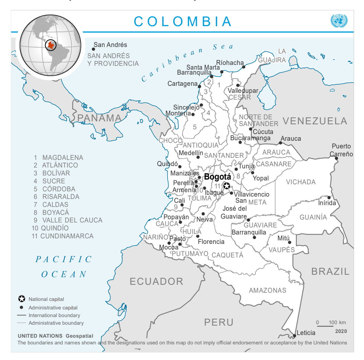
Figure 3: Location of Projects in the Colombia Case Study

The projects in this case study were implemented across a wide range of departments in Colombia. The three projects related to the Truth Commission had nationwide coverage, with CSO outreach activities in multiple departments. The project <a href="PBF/IRF-266">PBF/IRF-266</a> was implemented in Meta; <a href="PBF/COL/B-1">PBF/COL/B-1</a> in Chocó, Nariño, and Norte de Santander; <a href="PBF/IRF-400">PBF/IRF-400</a> in Chocó, Putumayo, Valle del Cauca, and Cauca; and PBF/IRF-401 in Cauca.