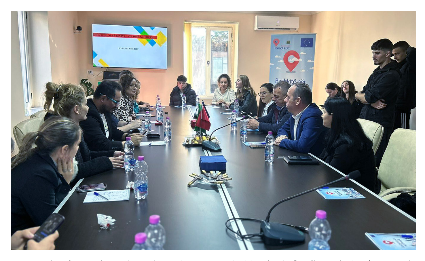
A cross-cutting theme of projects in the counter-hate speech case study was to engage youth in dialogue about the effects of hate speech and misinformation, as in this exchange between youth councils in the regional Western Balkans project.

was the "rising tide of ethnic and religious based hate rhetoric" that sharpened divides and undermined peacebuilding.<sup>288</sup> The project in the Republic of Moldova, PBF/IRF-481 (implemented by OHCHR, UN Women, and UNDP), was developed in response to the "considerable spike in hate speech" since the outbreak of conflict in Ukraine, which had triggered underlying ethnic, linguistic, and political divisions within Moldovan society.<sup>289</sup>