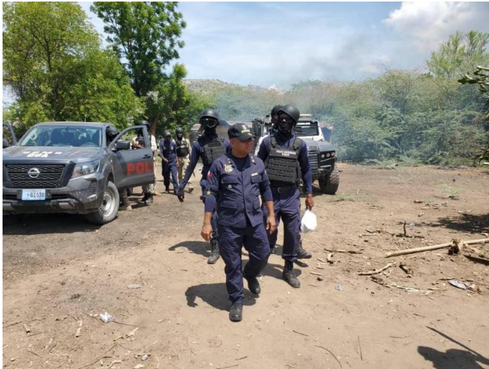
Police officers in a town in the Artibonite region, April 27, 2023

In June 2023, at a meeting with the HRS, HNP officials in Artibonite, despite the presence of these various units, felt that they did not have the operational and human resources needed to restore order and dismantle gangs. As a result, the police were content to simply patrol the main roads in the Artibonite valley and position themselves at strategic crossroads throughout the day. At the end of August 2023, the Director of the Artibonite Departmental Police was replaced. He had been appointed in January 2023, following the attack on police officers in Liancourt, his predecessor having been suspended from his duties and assigned to the HNP General Directorate.