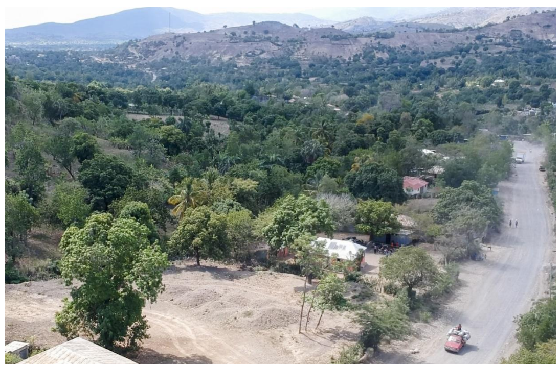
Gros Morne, a commune in the Artibonite departement

This region, which is likely to exert political and economic pressure on the capital and the country as a whole, has seen various forms of violence in its history. It has also been at the origin of protest movements that have destabilized the powers that be, in particular in 1986 against Duvalier, and again in 2004 against Aristide.