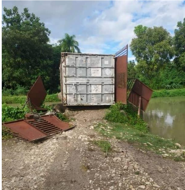
Residents of the commune of Liancourt have placed a container across a road leading to the commune of Liancourt, to prevent gang members from invading the area.

The number of people killed as a result of these abuses has reached extremely worrying proportions, compared with recent decades. While in 2022, a total of 63 lynchings were recorded across the country 33 , in the first ten months of 2023, the number has already reached 418, 11% of them in Lower Artibonite 34 .