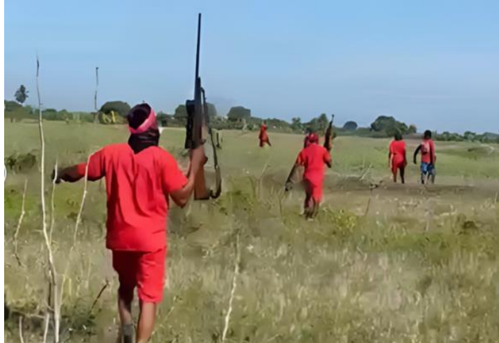
Members of the Gran Grif gang