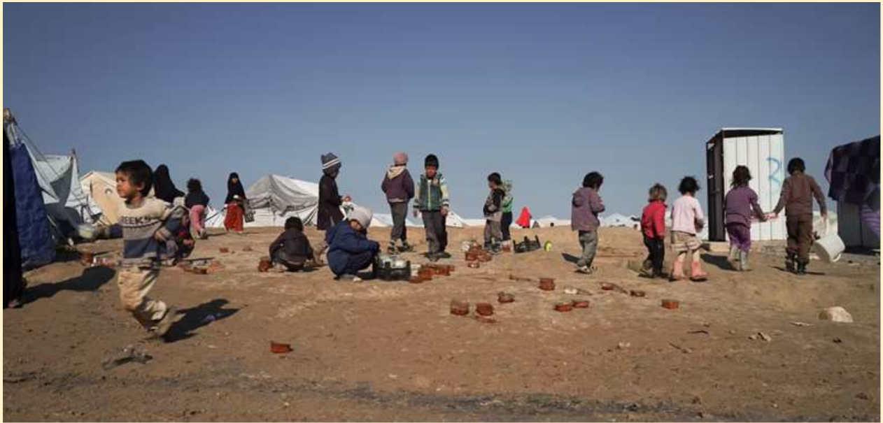
Children in Al Hawl Camp

INDEPENDENT INTERNATIONAL COMMISSION OF INQUIRY ON THE SYRIAN ARAB REPUBLIC