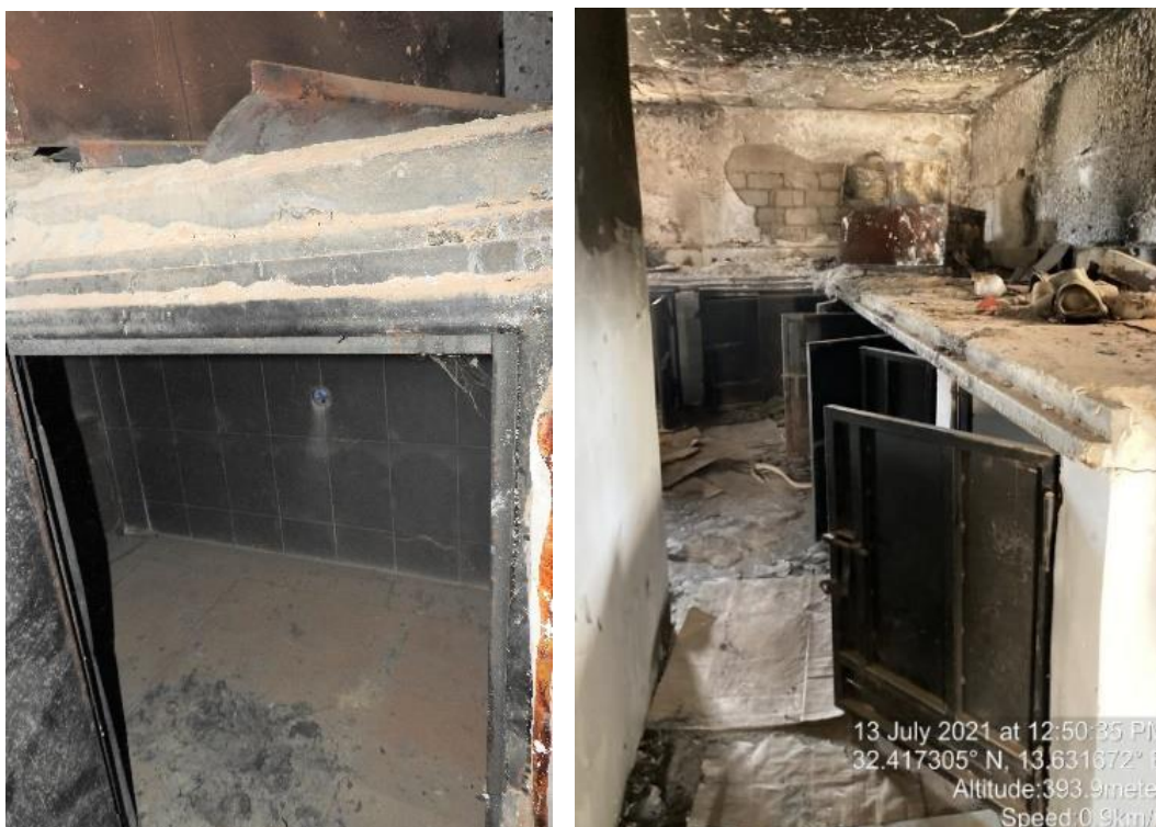
Photos taken by the Mission during site visits to the Boxes Prison showing the 0.8x0.8m boxes-like enclosures

94. The Mission visited the Boxes Prison during its missions in July 2021 and May 2022. This site was in an agricultural laboratory which had not been in use from 2011 until 2019 when the al-Kaniyat began using it as a detention facility. According to victims, it was called the Boxes Prison because it had nine small box-like iron enclosures in which the detainees were kept. The Mission's Forensic Doctor confirmed the existence of the boxes and measured them at 0.8x0.8m.