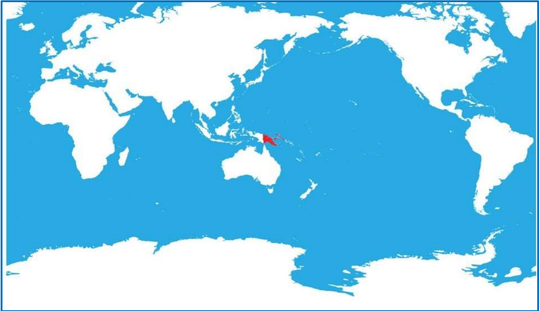
Papua New Guinea in the world