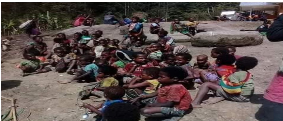
Fig.#6. Internally Displaced Kids in one of the Settlement in Intan Jaya regency