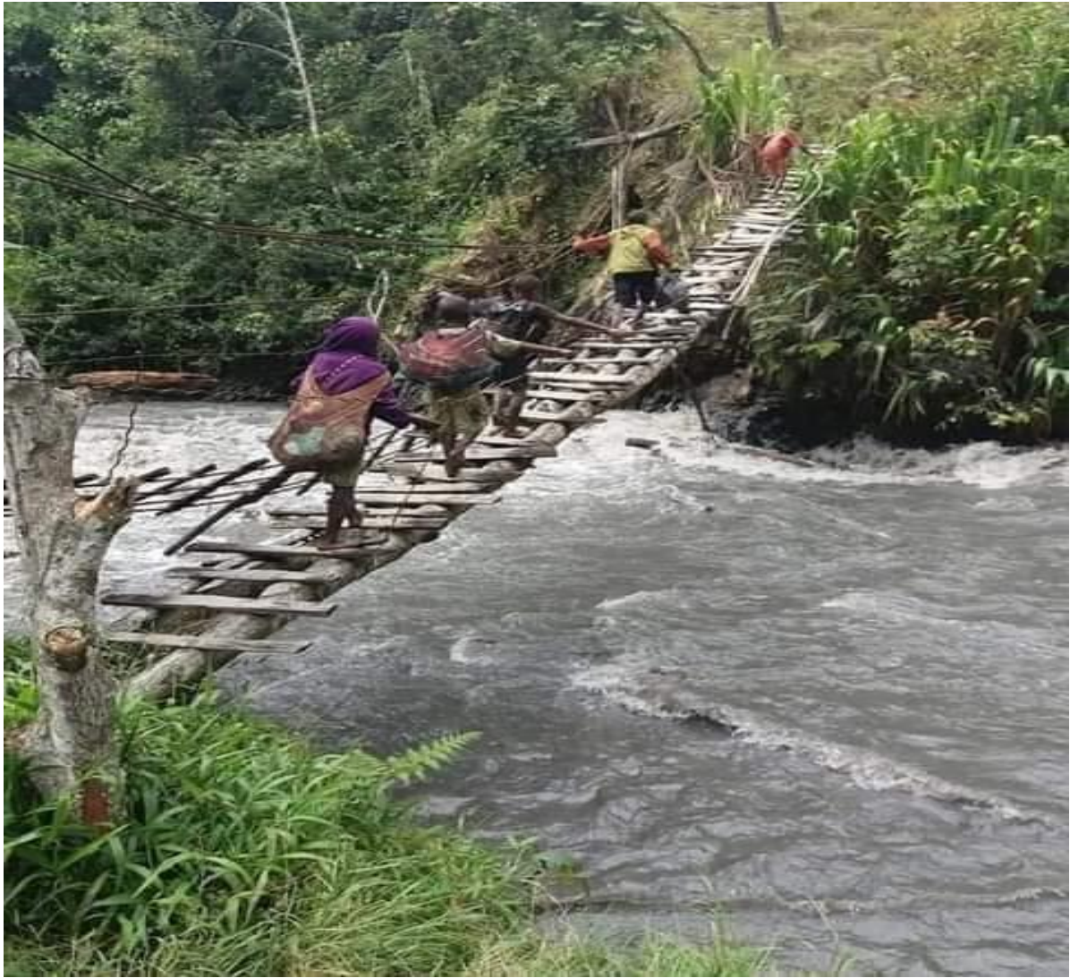
Fig.#5. Old people seen fleeing from the conflict zones in Intan Jaya regency