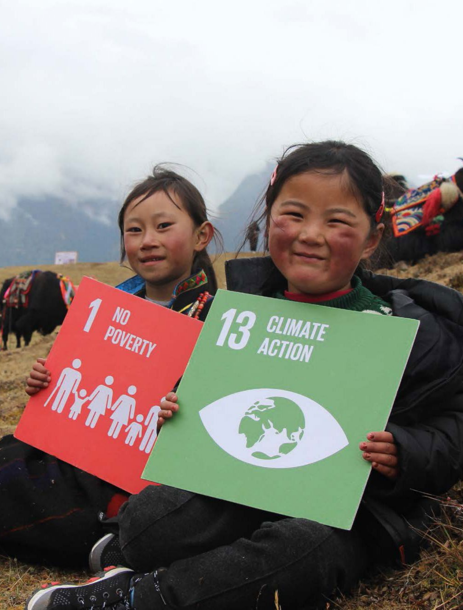
Children holding SDG icons in Bhutan.