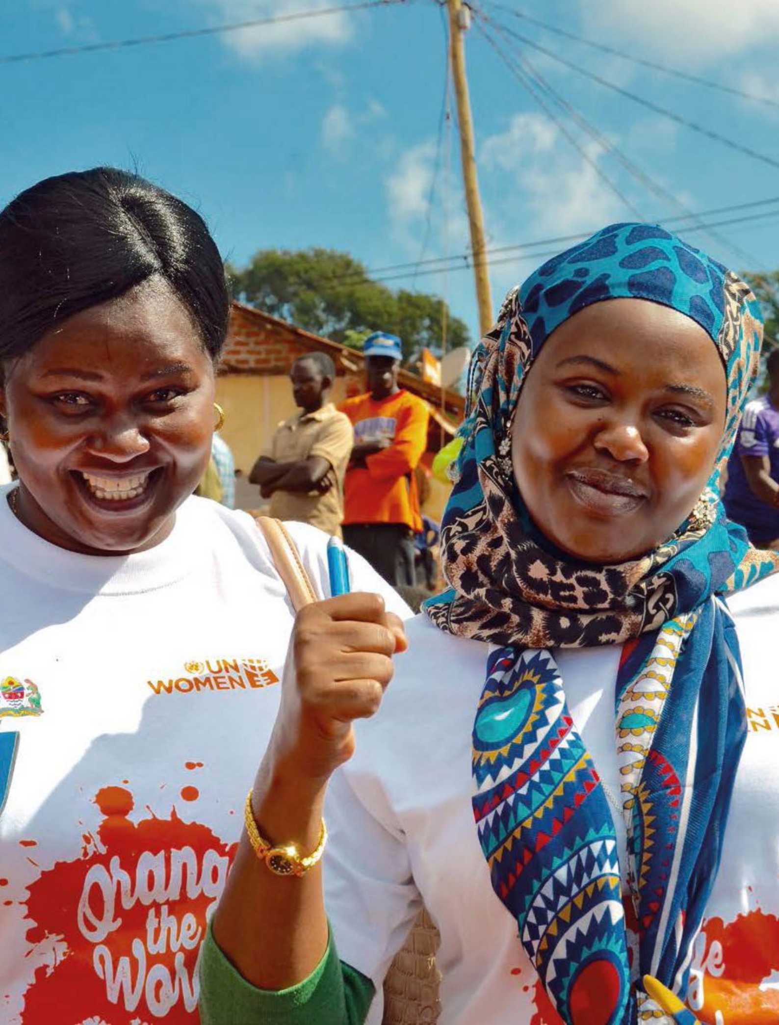
Orange the World Campaign in Tanzania.