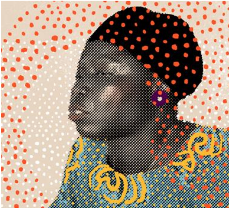
Illustration by Véronique Colfin. * Name changed.

“ I had been going with this pain and trauma... But thanks to the services I received, my medical condition greatly improved, and the pain, trauma dissipated.