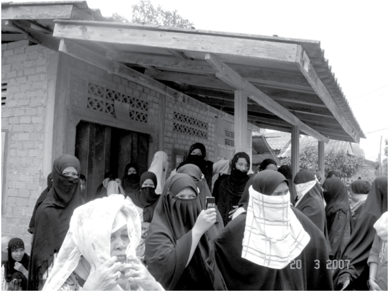
The demonstration at the Isla Huddin Pondok School, Sabayoy district, Songkhla, after two students were shot dead by armed forces believed by the villagers to be state officials on 19 March 2007