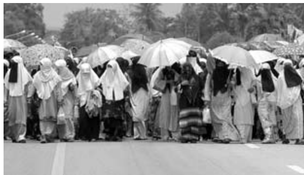
Malay Muslim women blocking the road

them very young children, and when being held in the military barracks, they have to bring their children along. 13 Reportedly, some women were subject to detention since they appeared to be owners of the vehicles used by their husbands to commit the violence, though they are unable to drive. In some instances, they were rounded up while being forced by the insurgents to tend to the wounded persons after clashes with the state officials. 14