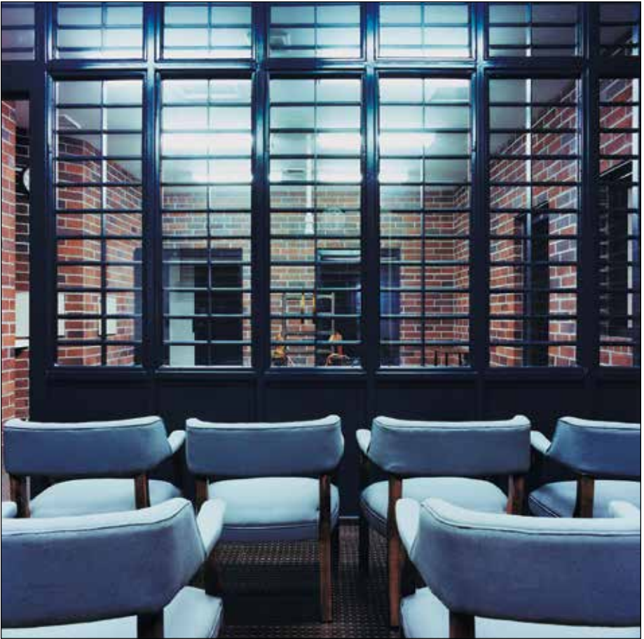
View from the Witness Room, The Omega Suites © Lucinda Devlin

“When one realizes the diversity of victims and the great pain each victim suffers, one would doubt that the death penalty serves victims.”