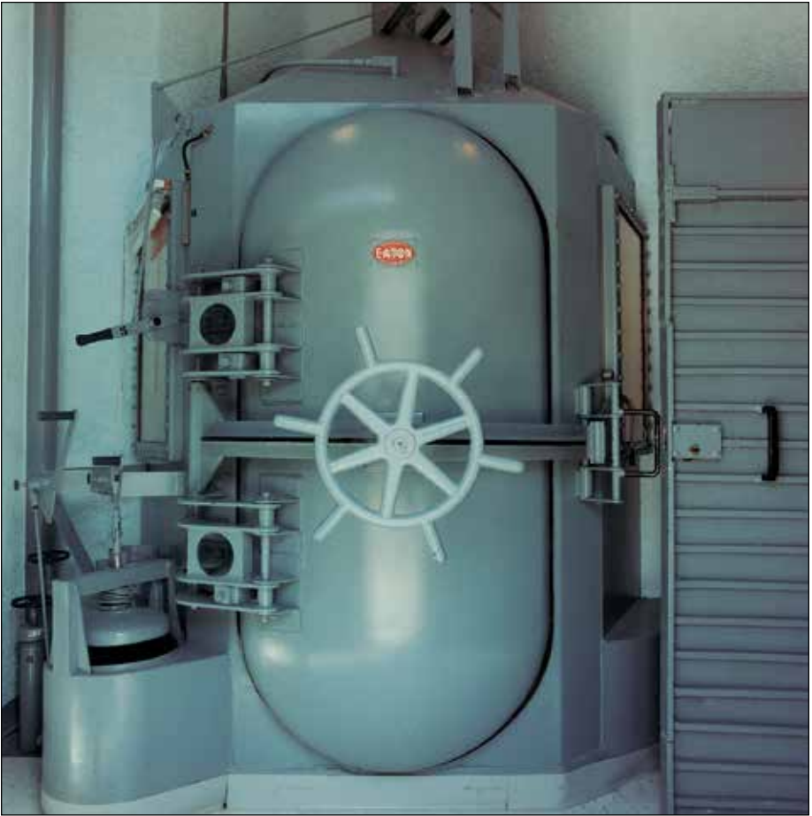
Gas Chamber, The Omega Suites ©Lucinda Devlin

“The majority of the world's countries are now abolitionist for all crimes. Most of those that retain the death penalty do not actually use it, and the minority of states that still execute people frequently do so in violation of prohibitions and restrictions set out under international law.”