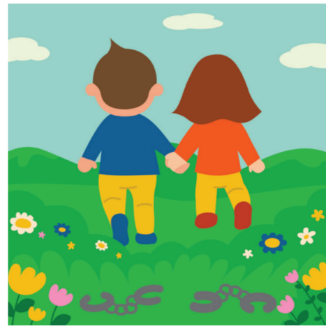
ARTICLE 4 Freedom from slavery