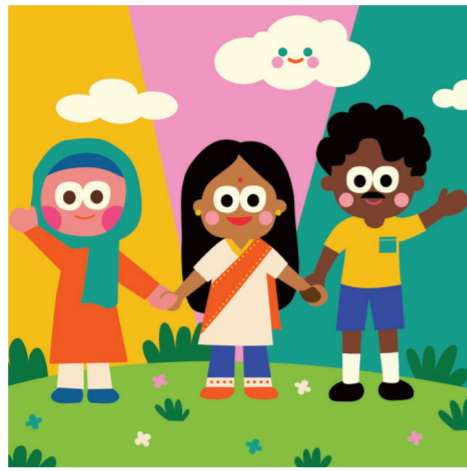
ARTICLE 2 Freedom from discrimination