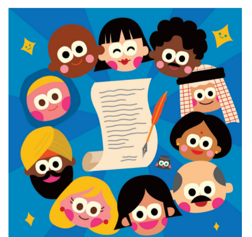
ARTICLE 30 Rights are inalienable