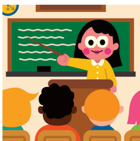
ARTICLE 26 Right to education