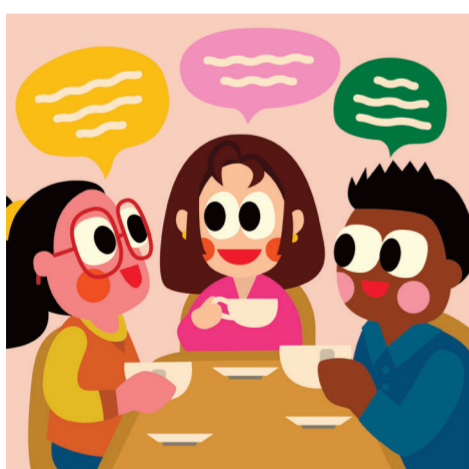
ARTICLE 19 Freedom of Expression