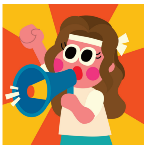
ARTICLE 20 Freedom of assembly