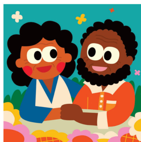
ARTICLE 22 Right to social security