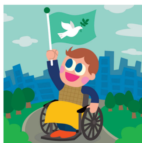
ARTICLE 28 Right to a free and fair world