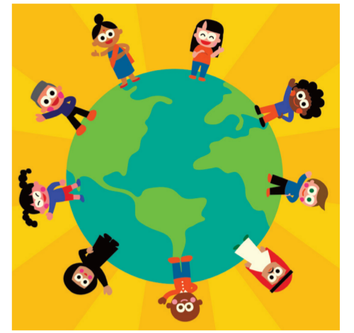
ARTICLE 6 Right to recognition before the law