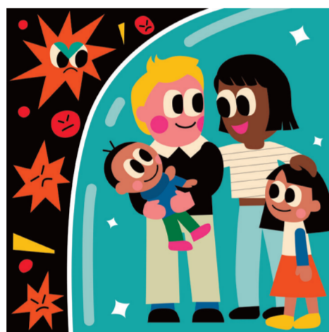
ARTICLE 14 Right to asylum