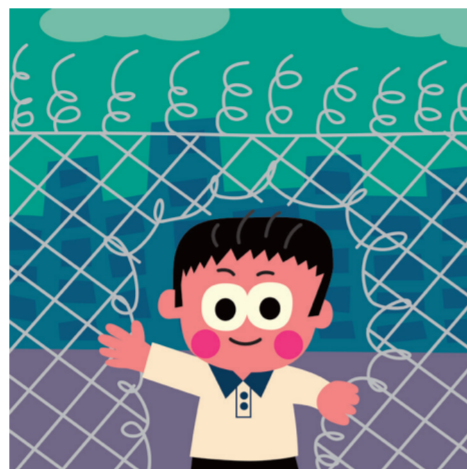
ARTICLE 9 Freedom from arbitrary detention