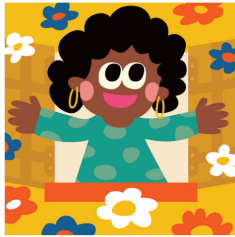
ARTICLE 3 Right to life