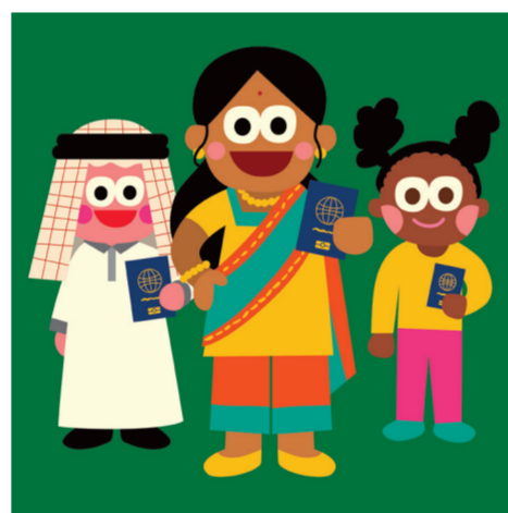
ARTICLE 15 Right to nationality