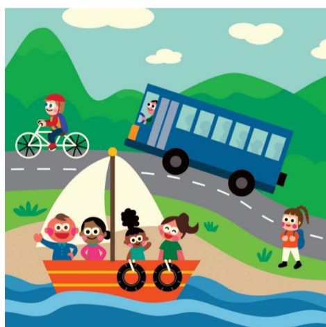
ARTICLE 13 Freedom of movement