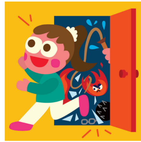
ARTICLE 5 Freedom from torture