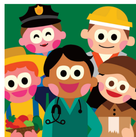
ARTICLE 23 Right to work