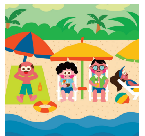
ARTICLE 24 Right to leisure and rest