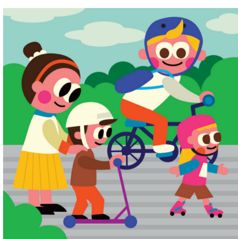
ARTICLE 25 Right to adequate standard of living