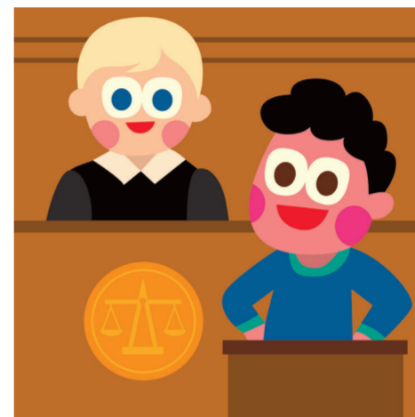
ARTICLE 11 Presumption of innocence