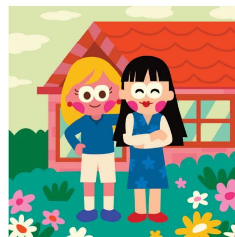
ARTICLE 17 Right to own property