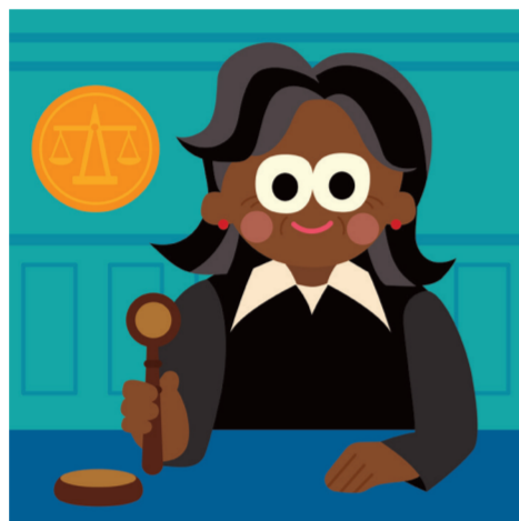
ARTICLE 8 Access to justice