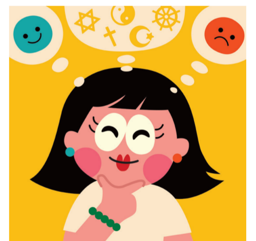
ARTICLE 18 Freedom of religion or belief