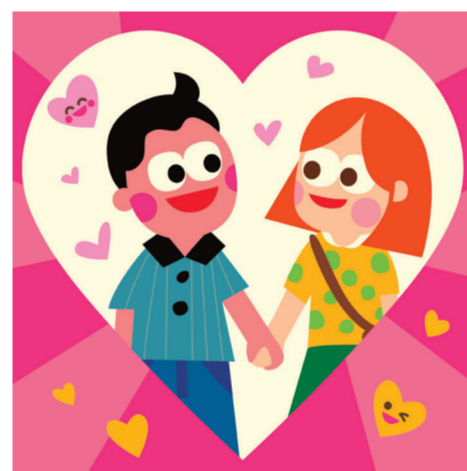
ARTICLE 16 Right to marriage and to found a family