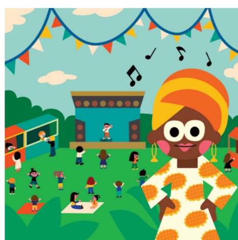
ARTICLE 27 Right to take part in cultural, artistic and scientific life