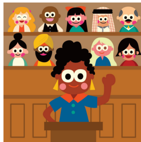
ARTICLE 10 Right to a fair trial