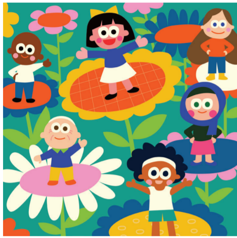
ARTICLE 1 Free and equal