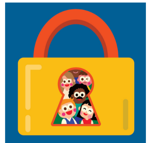
ARTICLE 12 Right to privacy