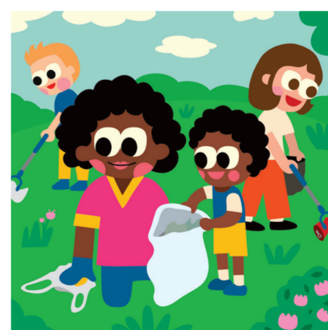
ARTICLE 29 Duty to your community